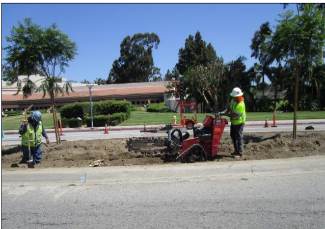
Trenching for irrigation east of Avalon.