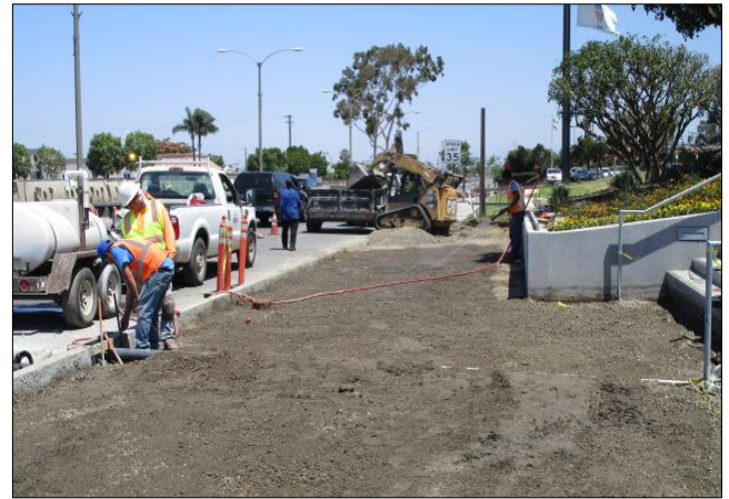
Installing drain pipe in front of City Hall.