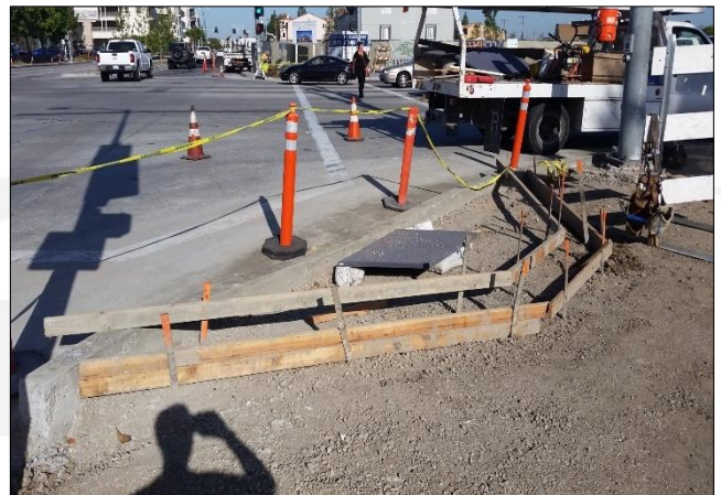
Type 1 curb ramp formed with ADA pad in place ready for Portland Cement Concrete.