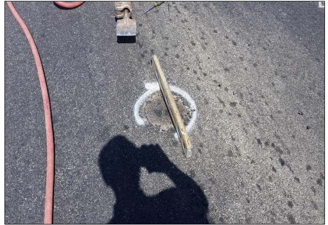
Powell leveling and raising water valve Carson parkway.