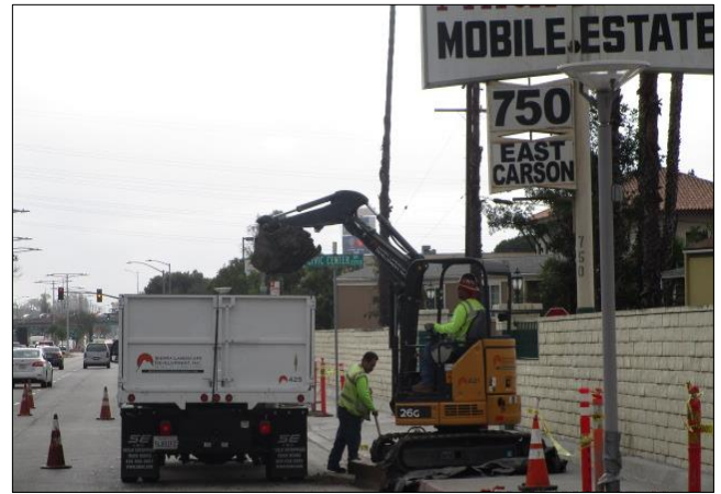
Excavating treewells south side west of I-405.