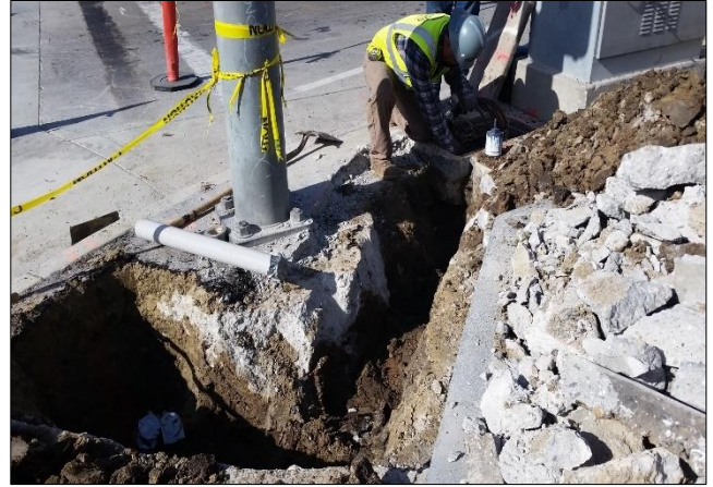
Belco terminates wire to traffic pullbox Avalon and Carson.