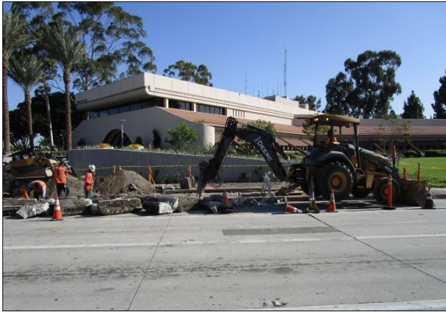
Removing existing curb and gutter on north side.