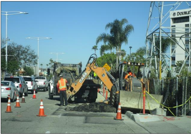
Doty Bros. installing water meter west of I-405.