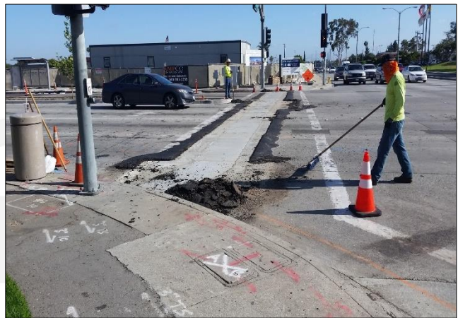
Powell removes asphalt cold mix.