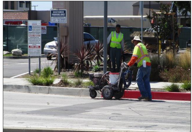
Painting red curb throughout project.