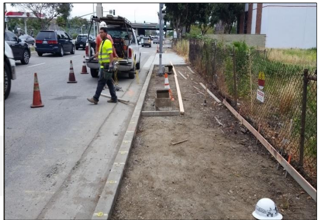
Belco is installing power lines on the east side of Avalon.