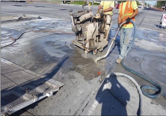
Smithson Electric cutting to install detector loops per plan.