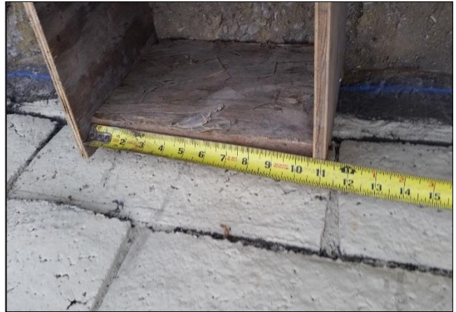
Minor pockets reduced to 1/2" side on west side of Carson.