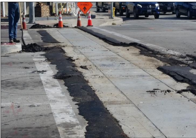
Traffic plates removed at Carson and Avalon post Portland Cement Concrete placement.