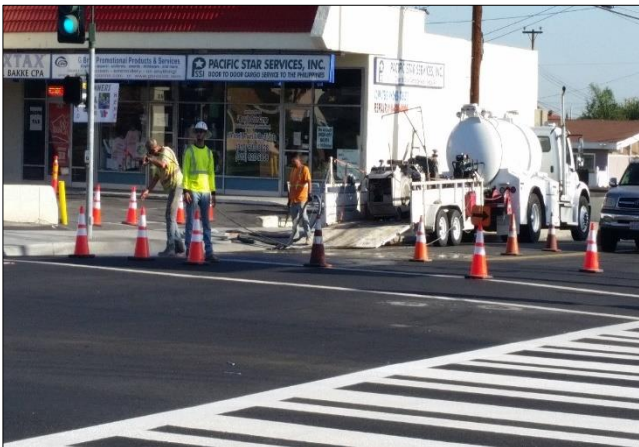
Smithson Electric cuts to install traffic loops at Dolores Street.