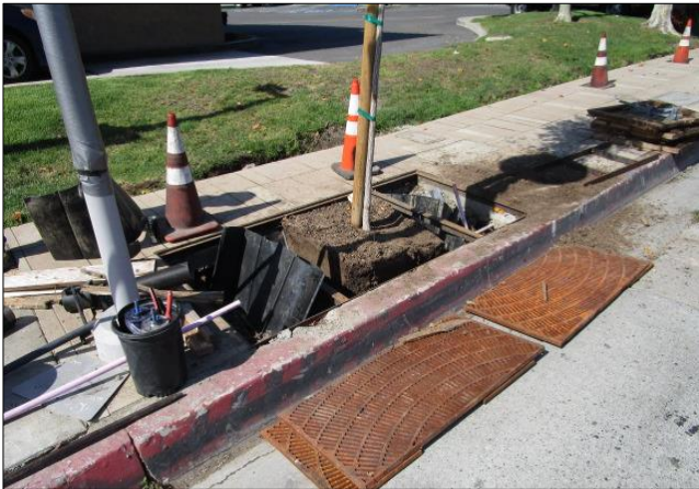
Installing tree grates on south side west of Avalon.