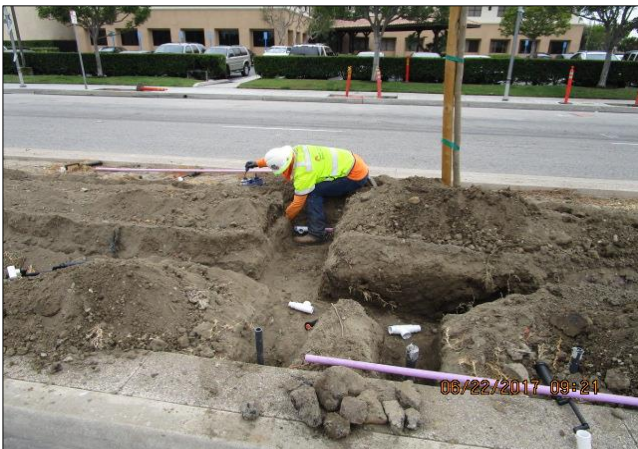
Installing irrigation in median east of Avalon.