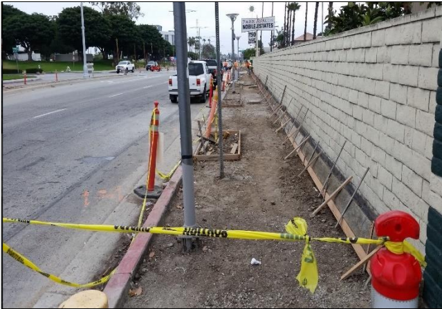
65' curb is being installed on the west side of Carson.