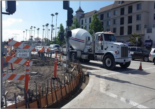
Powell placing 8"x24" curb and gutter at City Hall per plan.