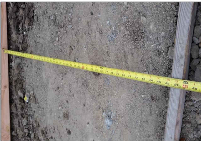
4' of curb is prepared to meet requirements of Sidewalk Carson.