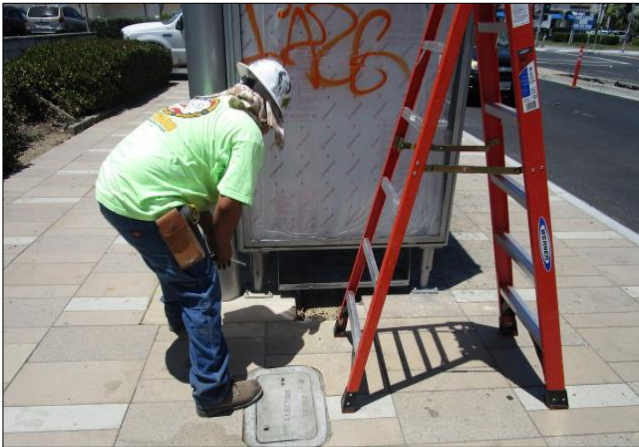
Completing shelter installation east of Grace.