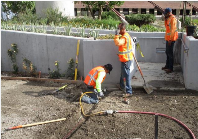
Installing planter drain at City Hall.