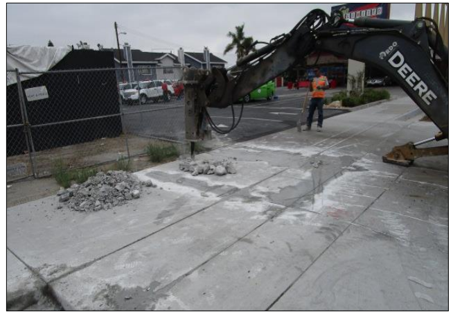
Removing sidewalk section at Carwash.