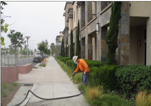
Sandblasting USA markings.