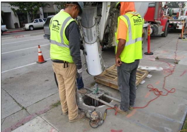
Placing foundation for pedestrian light in front of City Hall.