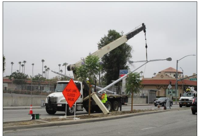
Standing streetlight east of Bonita.