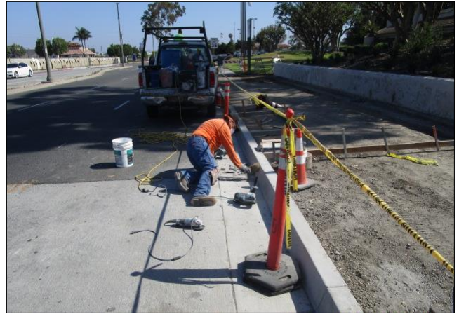
Finishing concrete work at City Hall.