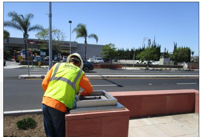
Installing lantern base west of Main.