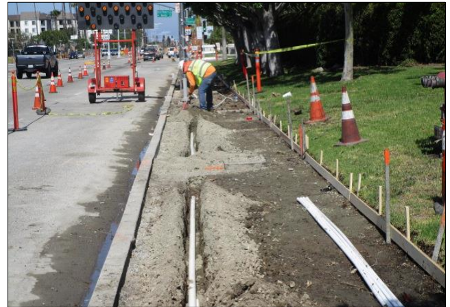
Installing sleeves and laterals west Civic Center.