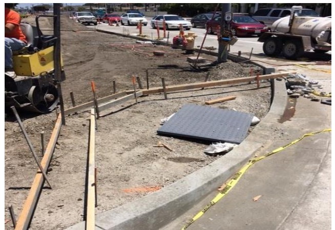
Grading and compacting.