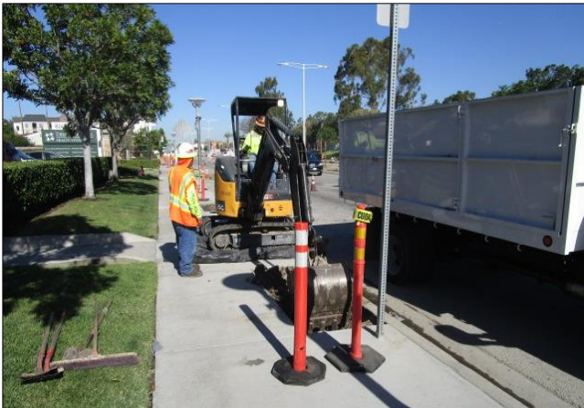
Excavating treewells south side east of Avalon.