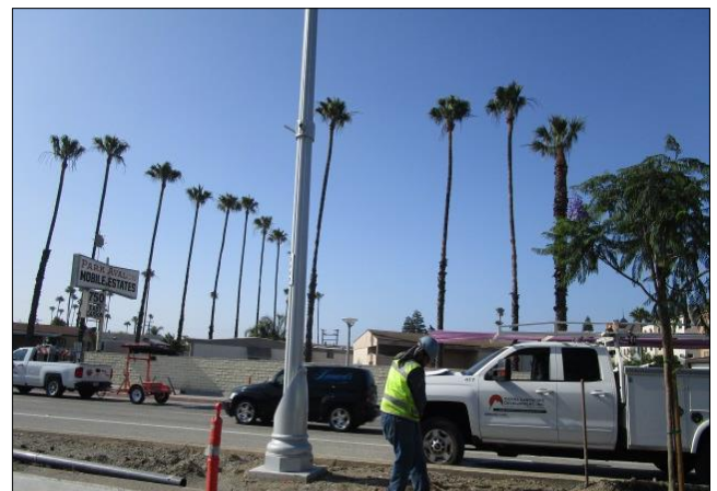
Trenching for irrigation lateral on Carson media east of Avalon.