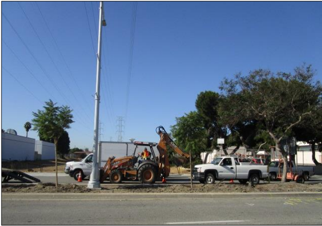
Doty Bros. installing water meter east Bonita.