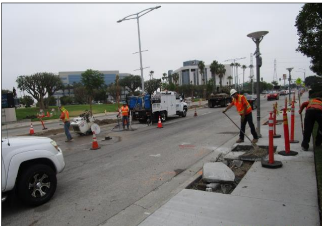
Doty Bros installing water meter east of Bonita.