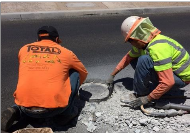
Water valve adjusting.