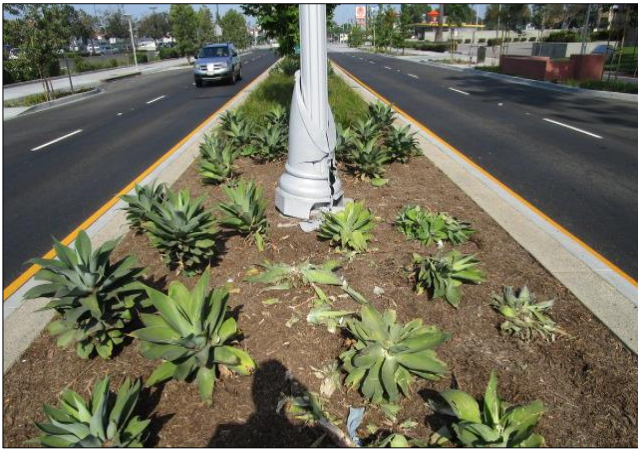
Damage to streetlight and landscape east of Main.