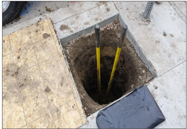
Foundation excavation for direction sign rebar cage per plan.