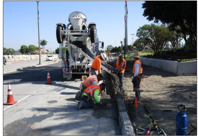
Placing new curb and gutter at City Hall.