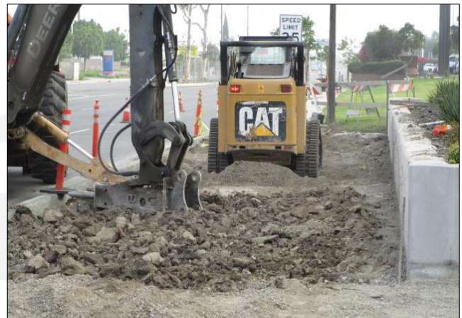
Grading north east corner of Avalon and Carson for paver underslab and south west.