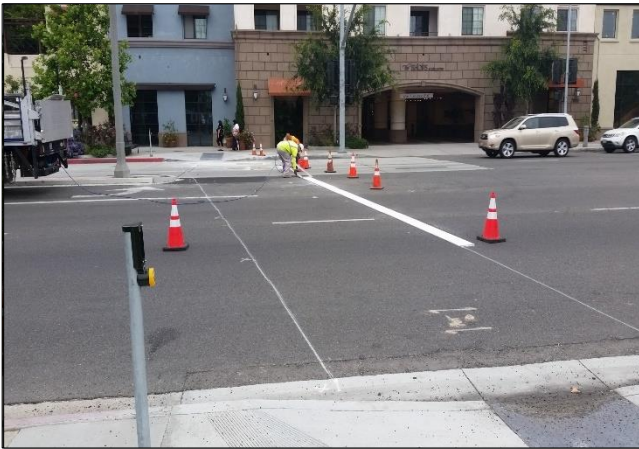
Trenching on the east side of Avalon for fiber optic conduit.