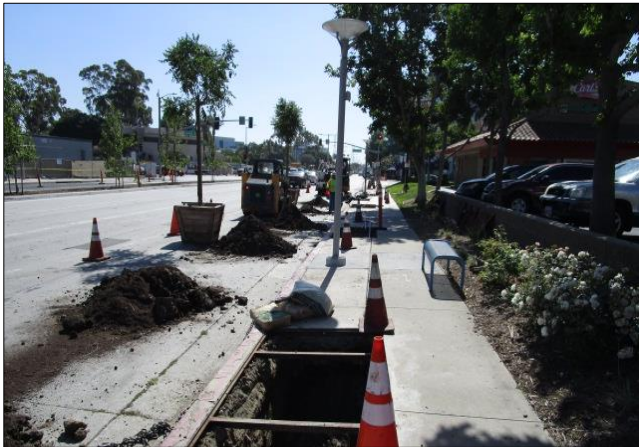
Excavating tree wells west of Avalon.