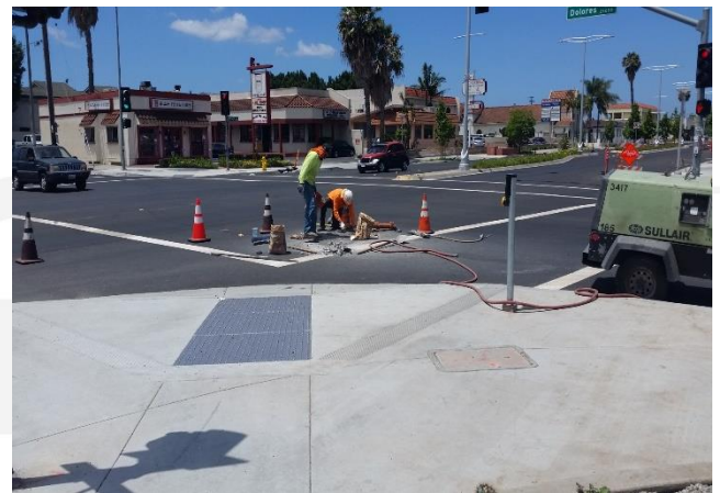
Powell raises valves at Carson Street.