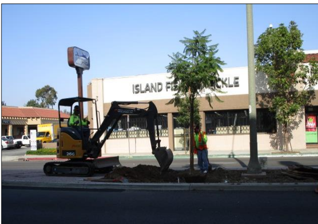
Planting trees on Avalon median south of Carson.