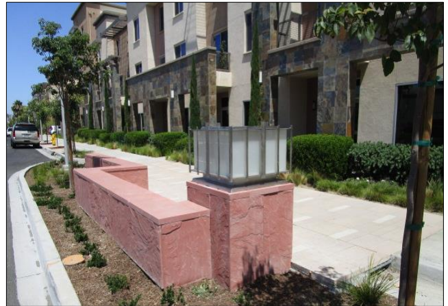
Installing lantern west of Grace.