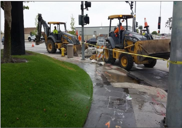
Powell demos Portland Cement Concrete intersection at Carson/Avalon for fiber optics.