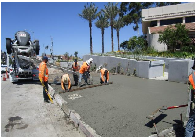
Placing sidewalk at City Hall.