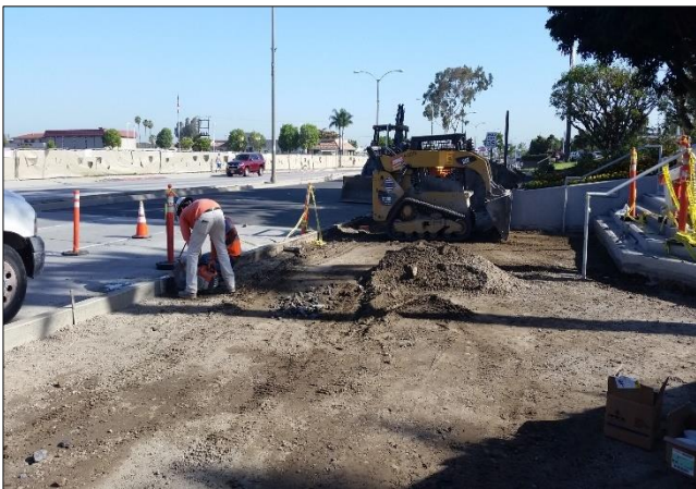
Powell sawcuts curb and gutter adjacent to City Hall for removal.