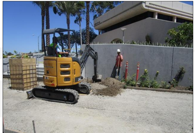
Excavating stump pit at City Hall.