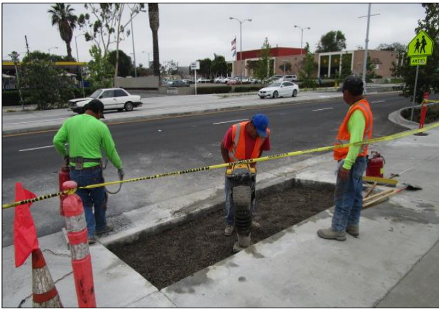
Compacting driveway section east of Main.