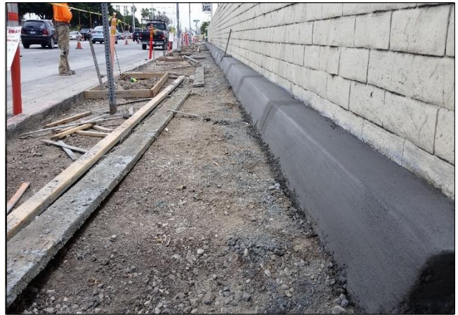
Art feature is installed on the west side of Main.