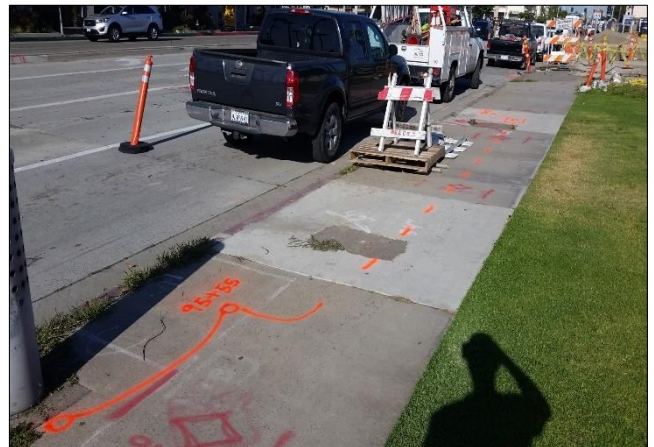
Belco scribed layout for tree well electric.