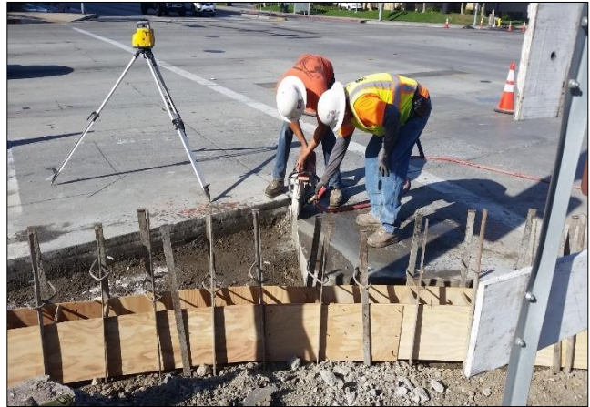
Powell cut all edges flat for curb and gutter placement at City Hall.