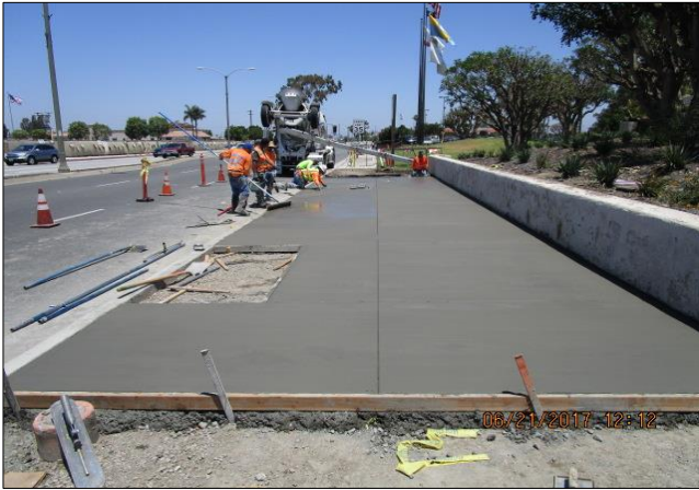
Placing sidewalk at City Hall.