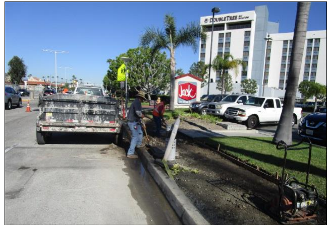
Removing sidewalk west of I-405.