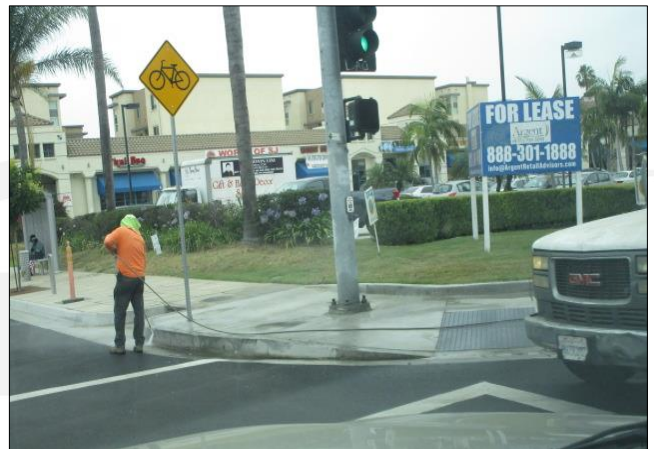
Sandblasting USA markings.