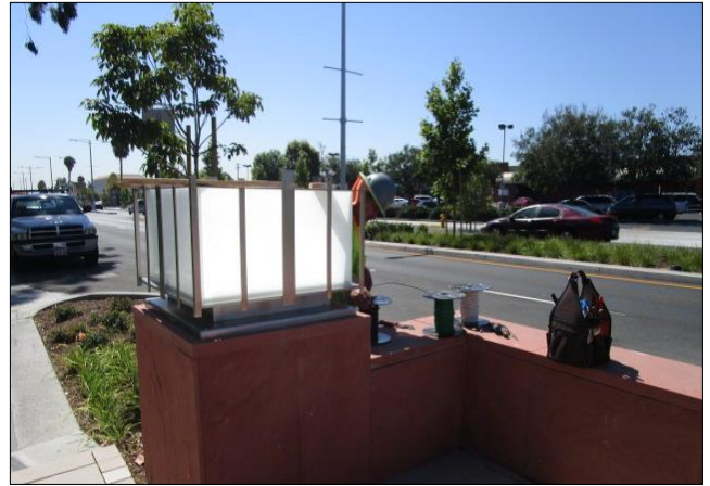
Wiring Plinth Lantern in front of library.