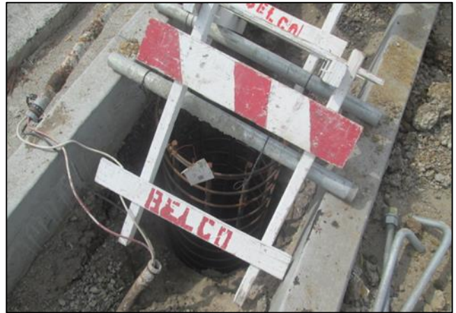
Cage No Anchor Bolts