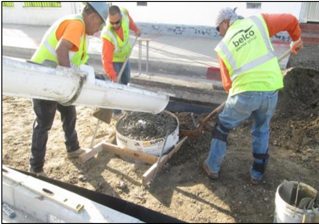
Foundations for F1 Street Light