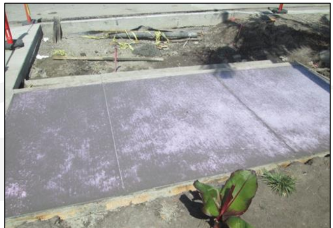
New Sidewalk at Church