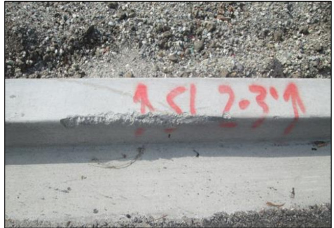
Broken New Curb to Remove All Locations