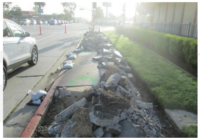
SW Fractured for Removals