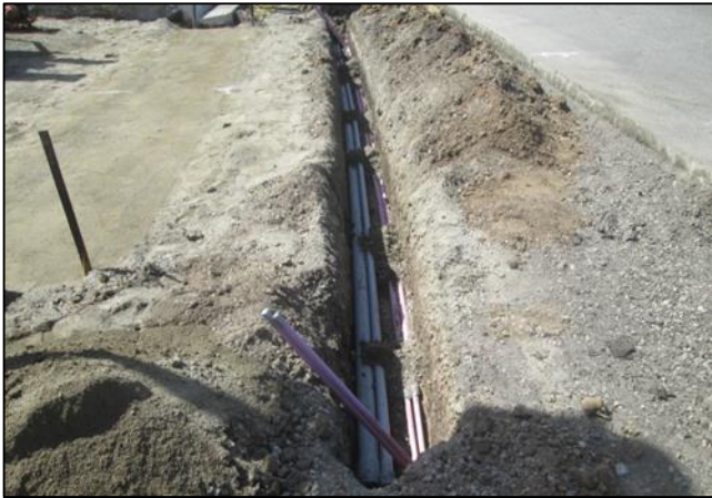
Sharing Trench Electrical and Irrigation