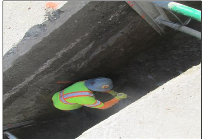
Repairing a Sewer Line