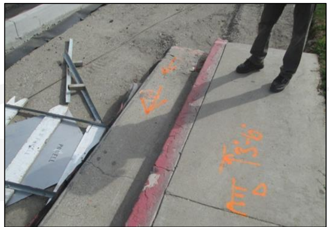
Trip Hazard Calls for SW Removal and Replacement