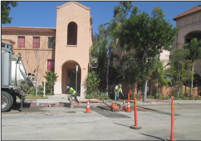
Vacuum Working on Pot Hole