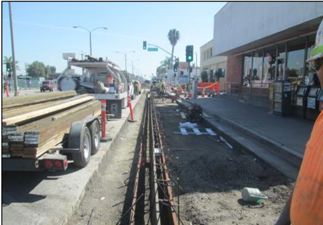
C&G Formed Ready for PCC