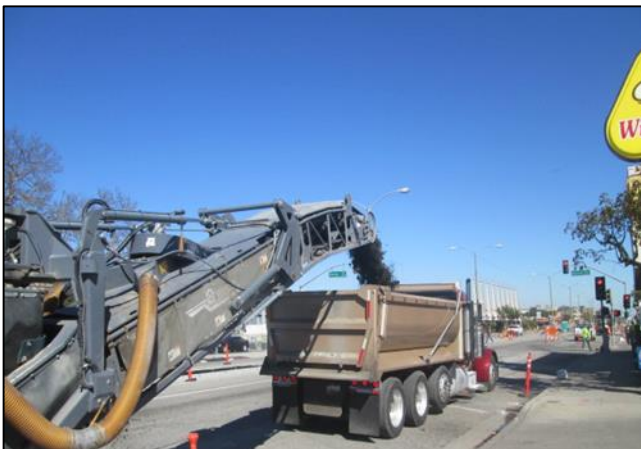
Pavement Grinder Working