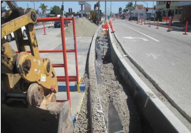
Median Ready for Grading