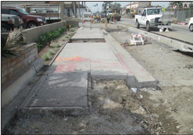
PT&T Now AT&T Vault Requires Attention