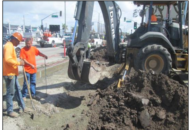
Excavating Wet Soil at Winchell's DW