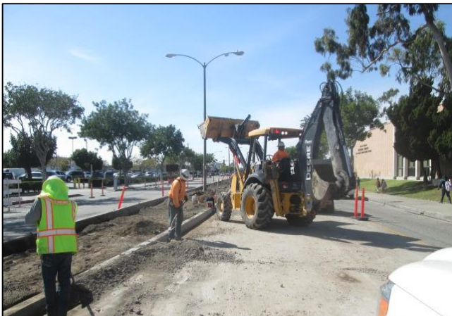
Grading for Median Landscape