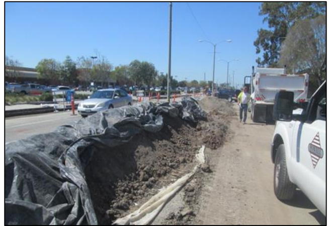
Spoil Pile Being Tested Odor of Hydrocarbons