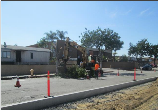
Tree Removal West of Delores