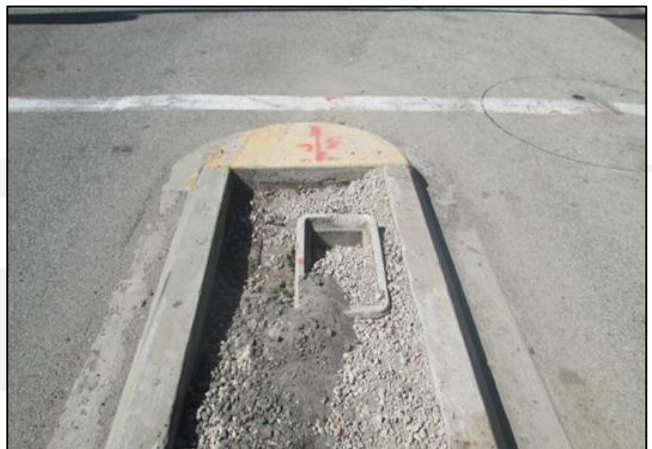
CMB in Median