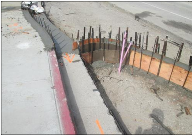
Bump Out Ready to be Poured