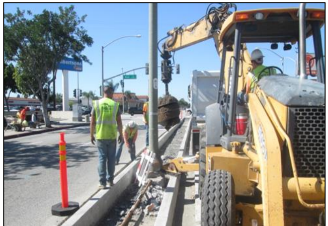
Auguring Hole for Street Light Footing