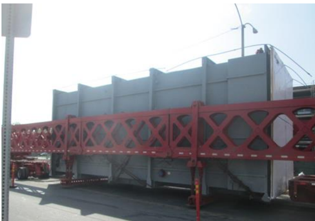
Wide Load Stuck on Carson St.