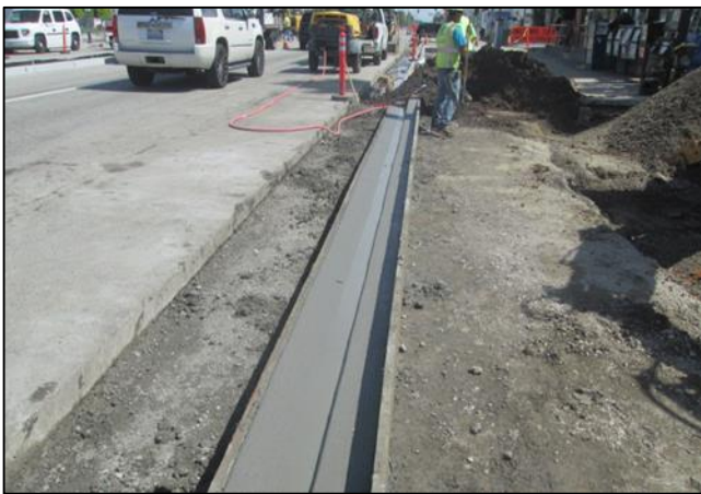
DW C&G at Winchell's