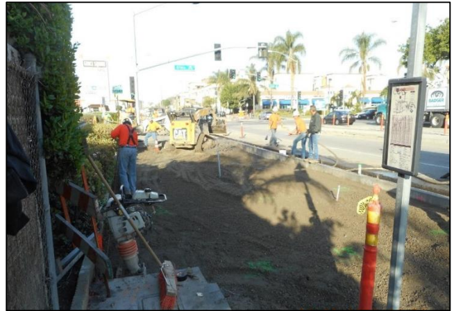
Preparing for Sidewalk and AC Pave