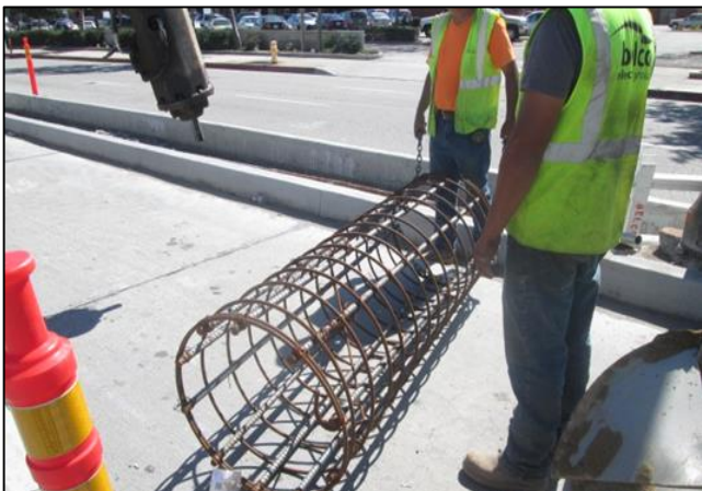
Street Light Rebar Cage