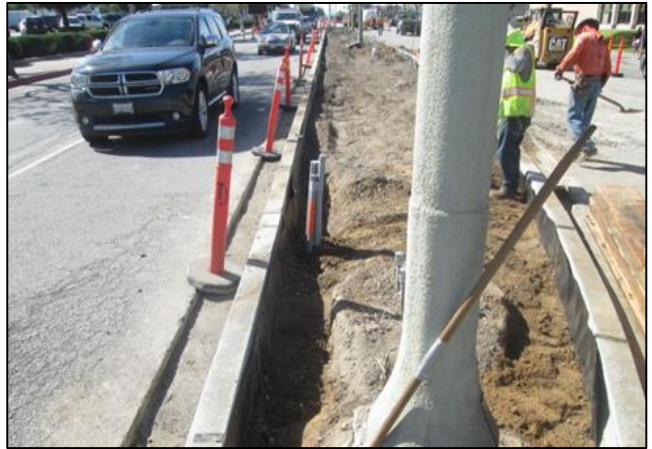
Median Water Proofing Complete