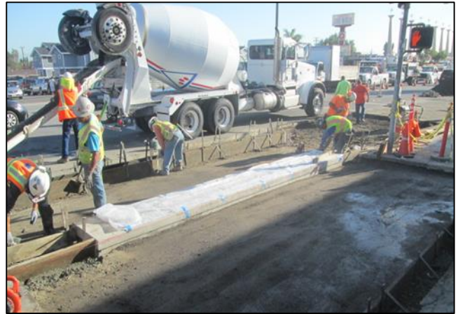
Driveway East of Winchell's