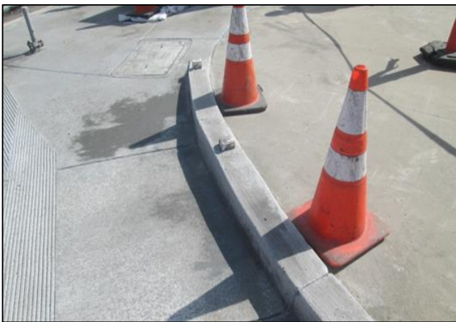
C&G at CB (Catch Basin)