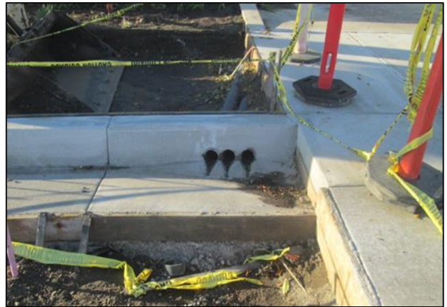
Drain Line Thru Curb at Church