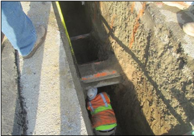
Excavation for Reclaimed Water Line