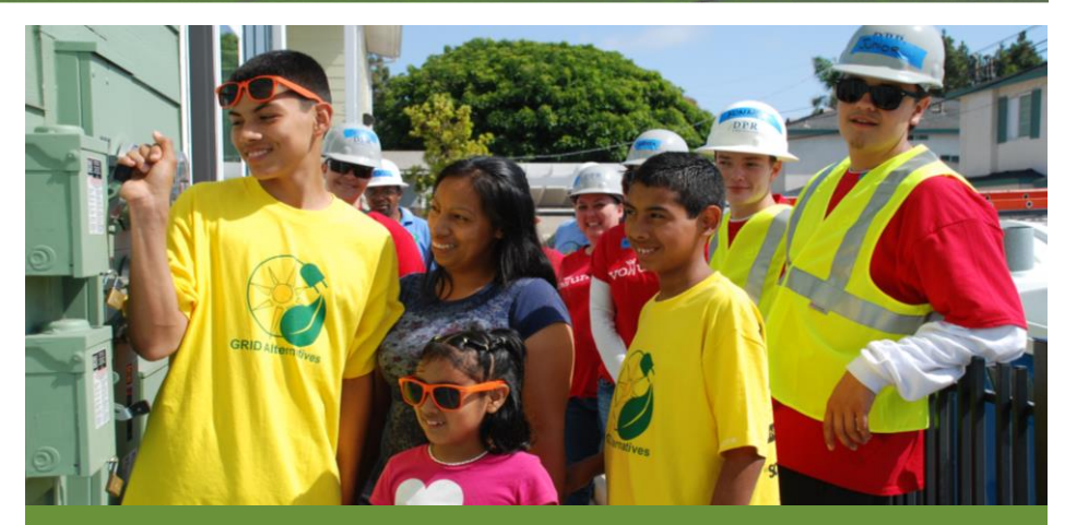
Cheered on by their volunteer installation team, a local family flips the switch on a system that will save them $22,000 over its expected 30-year lifetime.

Through this simple act of installing solar electric systems, we are able to provide families a long-term solution to high energy bills, and offer community members hands-on experience that can help them obtain employment in the rapidly growing solar industry, all while producing clean energy and reducing carbon emissions.