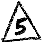
EXHIBIT NO. 2