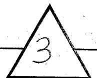
EXHIBIT NO. 1

Location Map Project No. 1285 Left Turn Phase - Avalon Boulevard at Sepulveda Boulevard