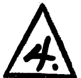
EXHIBIT NO. 1