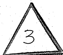
EXHIBIT NO. 1