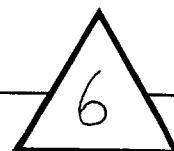
EXHIBIT NO. 1

Location Map Request for Street Name Change Existing Street Name: Lenardo Drive (in Boulevards at South Bay) Proposed Street Name: Jim Dear Boulevard