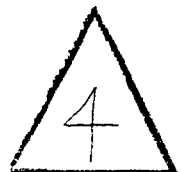
EXHIBIT NO. 01