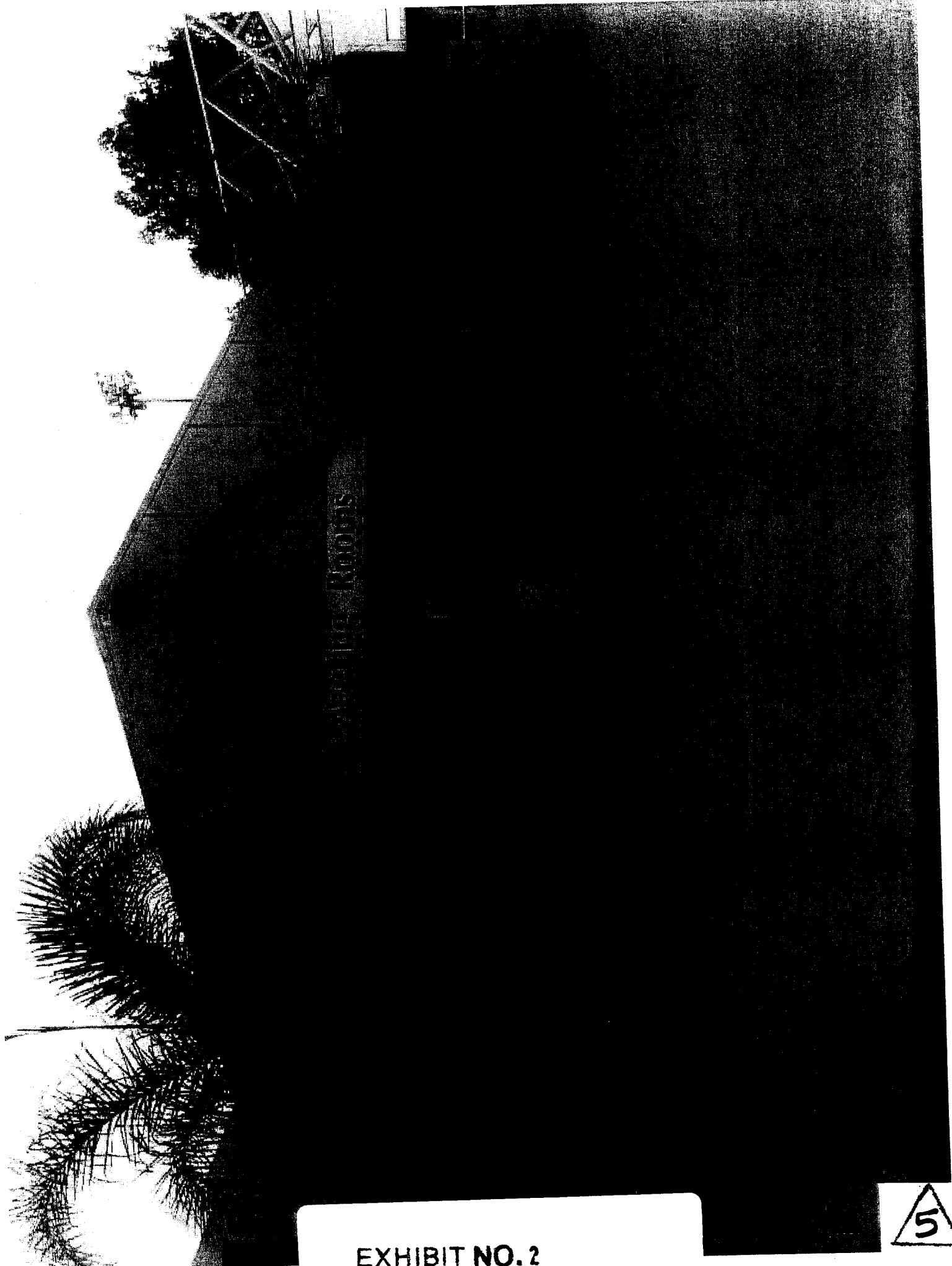
EXHIBIT NO. 2