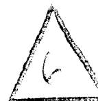
EXHIBIT NO. 2