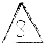
EXHIBIT NO. 03