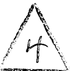
EXHIBIT NO. 02