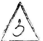
EXHIBIT NO. 01

All expenses charged to account # 01-90-400-003-6009 - revenues to corresponding revenue account