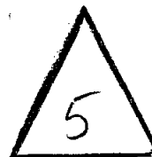
EXHIBIT NO. 02