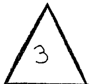
EXHIBIT NO. 01