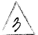
EXHIBIT NO. 01

The Cultural Arts Commission shall consist of seven (7) members, each of whom shall be and remain a resident of the City of Carson.