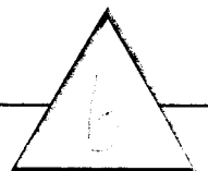
EXHIBIT NO. 1