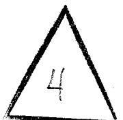
EXHIBIT NO. 01