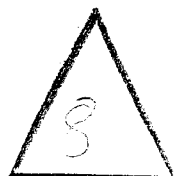
EXHIBIT NO. 05

www.bls.gov | Telephone: 1-202-691-5200 | TDD: 1-800-877-8339 | Contact Us