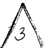
EXHIBIT NO. 01