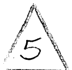
EXHIBIT NO. 02

ACTION: Mayor Dear ordered to receive and file the report, with no objections heard.