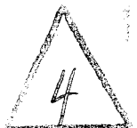
EXHIBIT NO. 02

ACTION: Mayor Dear ordered to receive and file the report, with no objections heard.