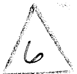
EXHIBIT NO. 02