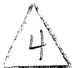
EXHIBIT NO. 01