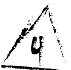
EXHIBIT NO 07

1.2 Compliance with Law. All work and services rendered hereunder shall be provided in accordance with all applicable ordinances, resolutions, statutes, rules and regulations of the City and any federal, state or local governmental agency of competent jurisdiction.