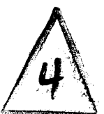
EXHIBIT NO. 01