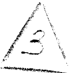
EXHIBIT NO. 01