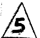
EXHIBIT NO. 01