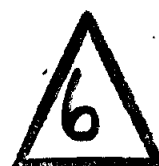
EXHIBIT NO 02

When the voters of Los Angeles approved a Charter Amendment in 2002 changing the City of Los Angeles municipal elections dates, it moved the Primary Nominating Election date to the same day that other cities in the area are also holding elections. The City of Los Angeles conducts the elections for the Los Angeles Unified School District Board Members and the Los Angeles Community College District Trustees. Portions of those jurisdictions overlap the boundaries of these other cities. This provides an opportunity to consolidate those elections which is more convenient for the voter, reduces costs, and improves voter turnout.