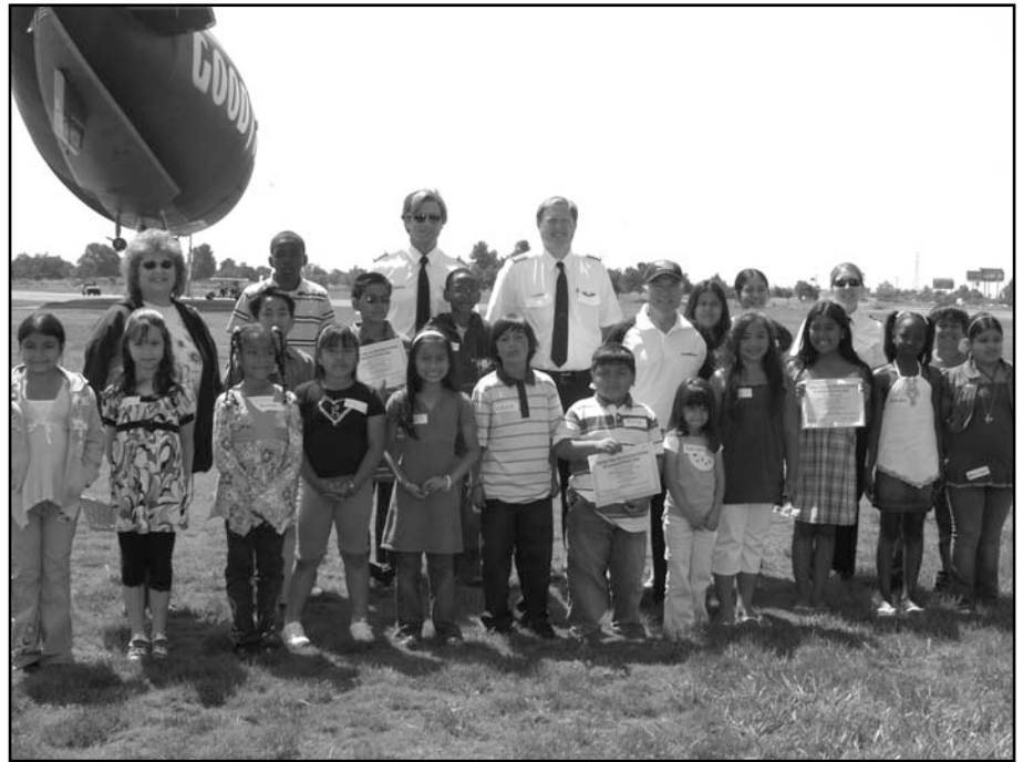
Finalists in the Good Year Blimp's card-making contest pose for a souvenir shot after the awards ceremony on May 31.

Around the same time, Carson was going through the process of incorporation. As the citizens