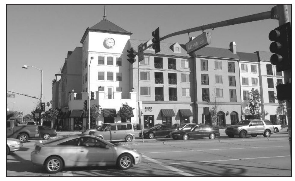
The Renaissance at City Center at the corner of Carson St. and Avalon Blvd.

The City of Carson has a balanced ethnic and cultural mix that lives together in accord and opulence. Carson is in the South Bay's "Golden Triangle" of trade – an area bound by LAX, the twin ports of Long Beach and Los Angeles, and the Alameda corridor. Carson is also intersected by four Southland freeways that make it a major gateway to the Pacific Rim. Carson's strategic position