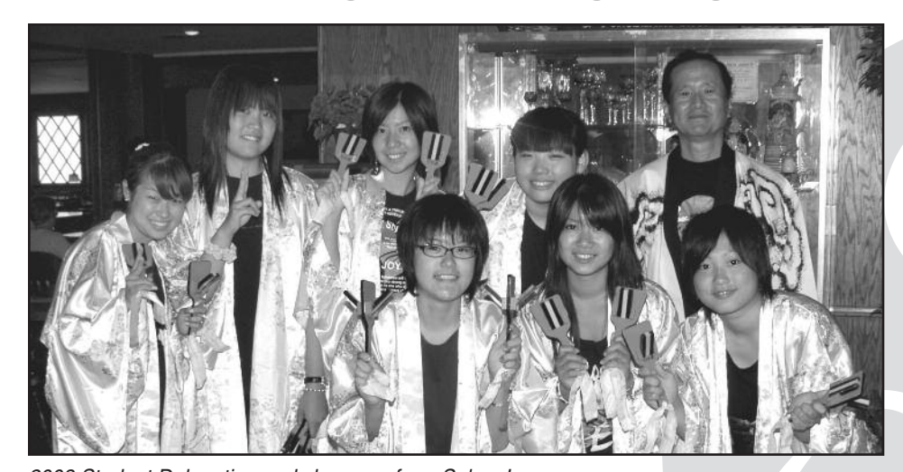
2008 Student Delegation and chaperon from Soka, Japan.

arson Sister Cities Association (CSCA) is seeking host families for foreign students who will be visiting from Soka City, Japan this summer.