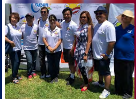
Filipino-American Chamber of Commerce SouthBay Los Angeles (FACC-SLAA)