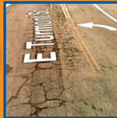
Pre-Construction: Turmont Street