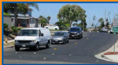
Post-Construction: Turmont Street

For more details on the rehabilitation project on Turmont Street see page 13