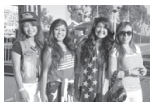
It was a great day to meet up with old friends and make new ones.

In the same event, Philippine-American Friendship Day was also celebrated affirming the continuing strength of Filipino-American friendship and the enduring bonds and the concept of "special relations" between the Philippine and the American republics.