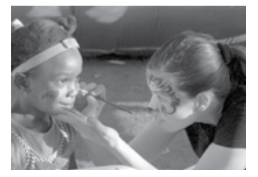
Children enjoyed face painting.