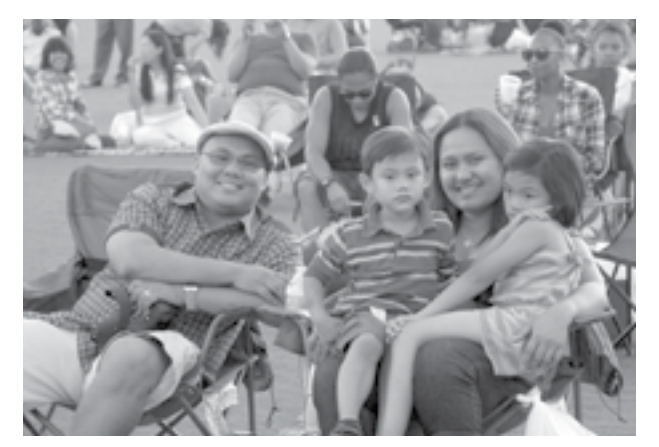
Family enjoying the 4th of July Celebration.

Hundreds of families turned out to see the fireworks display and watch the non-stop entertainment on stage that started at 1 p.m. Hundreds of volunteers also came out to ensure the success of this annual event.