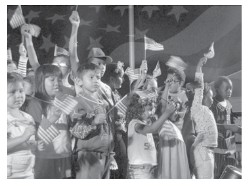
Kids enjoy the fireworks show patriotically waving American flags.

or the fifth year, the Carson community celebrated Independence Day with fireworks, music, food booths, arts and crafts, and other activities for every member of the family to enjoy at the StubHub! Center.