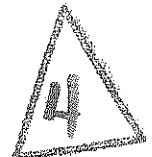
EXHIBIT NO. 2