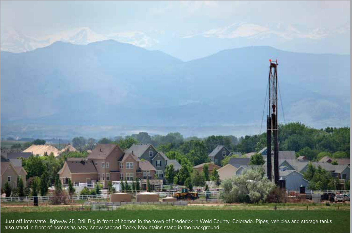
Just off Interstate Highway 25, Drill Rig in front of homes in the town of Frederick in Weld County, Colorado. Pipes, vehicles and storage tanks also stand in front of homes as hazy, snow capped Rocky Mountains stand in the background.