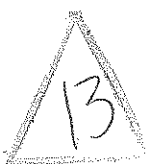
EXHIBIT NO. 4 -

731 West 11 th Street, Claremont, CA 91711 Tel 909-626-0705 Fax 909-982-2412 State Lic. #747955