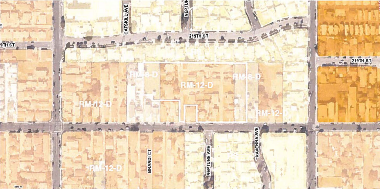
Figure above shows project site in context to its surrounding zoning.

Land uses surrounding the project site include residential, commercial, public/institutional, and utility (So Cal Edison Electrical Substation) uses.