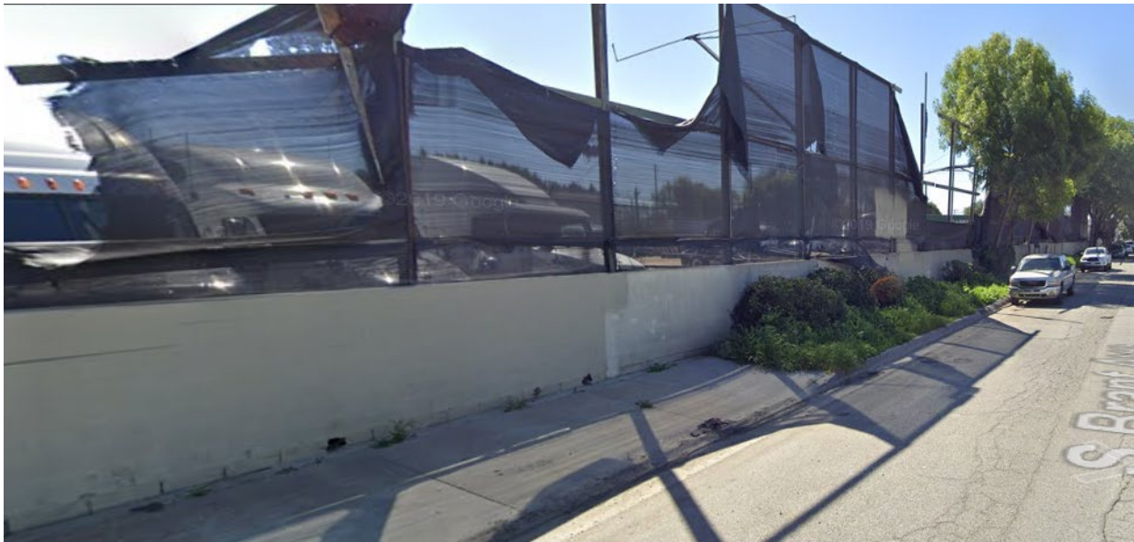
Figure (b) Block wall and fencing material facing Brant Ave