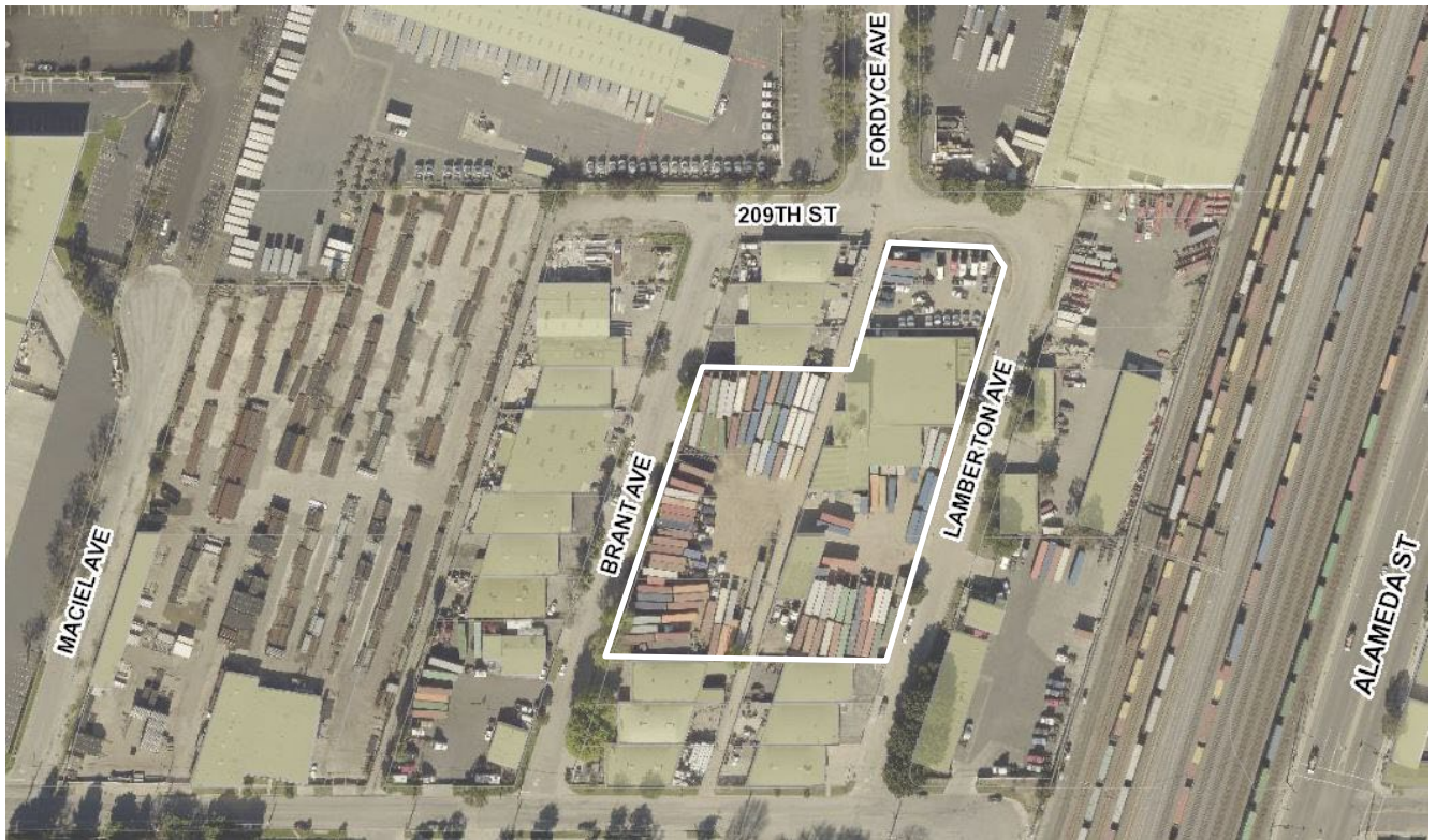
Figure (a) Project Site in context to surrounding zoning.

The following table provides a summary of information regarding the project site: