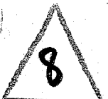
EXHIBIT NO. - 3