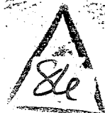
EXHIBIT NO. 4 -

CITY HALL • 701 E. CARSON STREET • P.O. BOX 6234 • CARSON, CA 90749 • (310) 830-7600 WEBSITE: ci.carson.ca.us