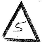
EXHIBIT NO. - 1