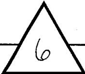
EXHIBIT NO. 1