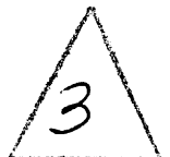
EXHIBIT NO. 01

"NOTICE IS HEREBY GIVEN that Cardinal (hereinafter referred to as "Franchisee"), a Delaware corporation, has filed an application with the City Council of the city of Carson requesting that the City Council grant it a nonpublic utility franchise for a period of twenty-five (25) years from and after the date upon which the franchise grant shall become effective, to lay or construct from time to time, and to maintain, operate, renew, repair, change the size of, remove or abandon in place pipes and pipelines for the collection, transportation or distribution of oil, gas, gasoline, petroleum, wet gas, hydrocarbon substances,