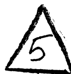
EXHIBIT NO. 2