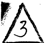
EXHIBIT NO. 1