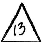
EXHIBIT NO. 4