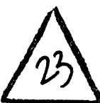
EXHIBIT NO. A-1