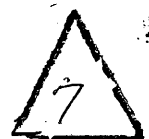
EXHIBIT NO. 01