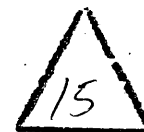
EXHIBIT NO. 03