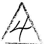
EXHIBIT NO. 02