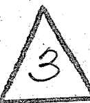
EXHIBIT NO. 01