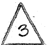
EXHIBIT NO. 01