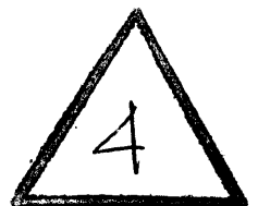
EXHIBIT NO. 1