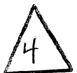
EXHIBIT NO. 02