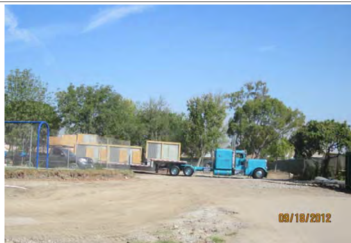
Air Conditioning Unit Deliveries