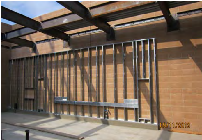
Framing (Recreation Area)