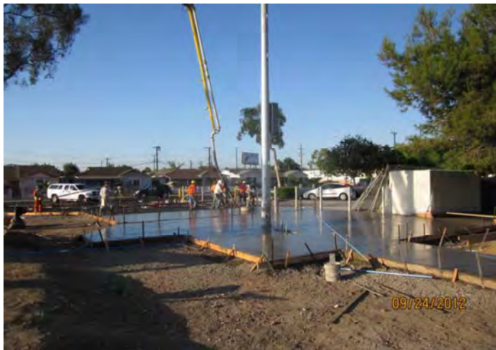
Pouring Concrete (Southwest Corner of Field)