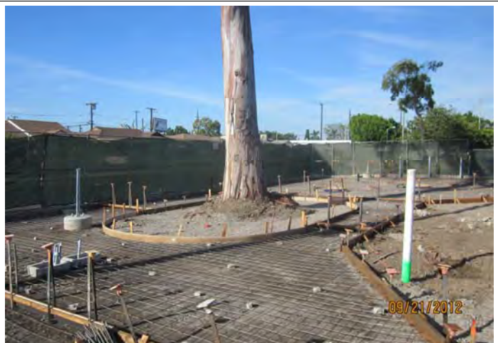
Prep for Concrete Pour (Southwest Corner of Field)