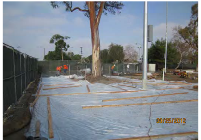
Poured Concrete (Southwest Corner of Field)