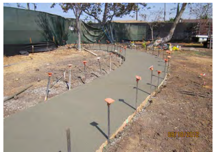
Completed Concrete Pour (Walkway Near Pool)