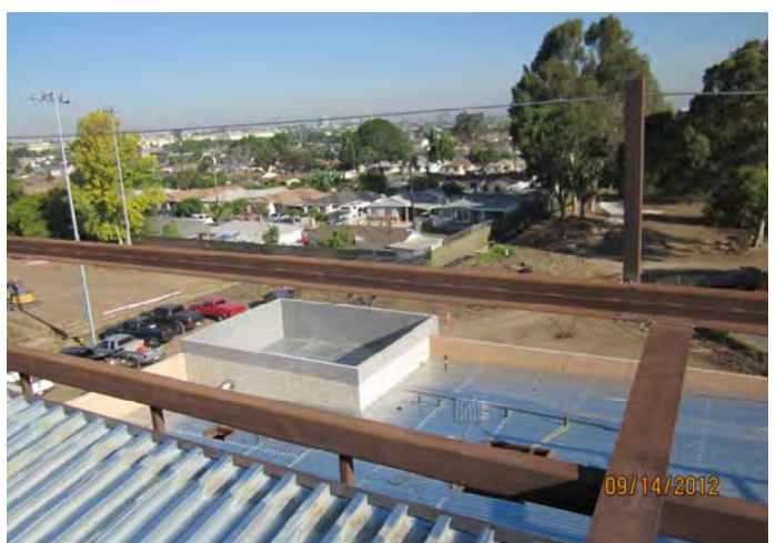
Metal Decking (Low Roof)