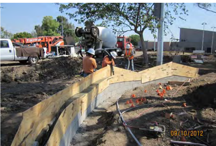
Seatwall Concrete Pour (Adjacent to Restroom Building)