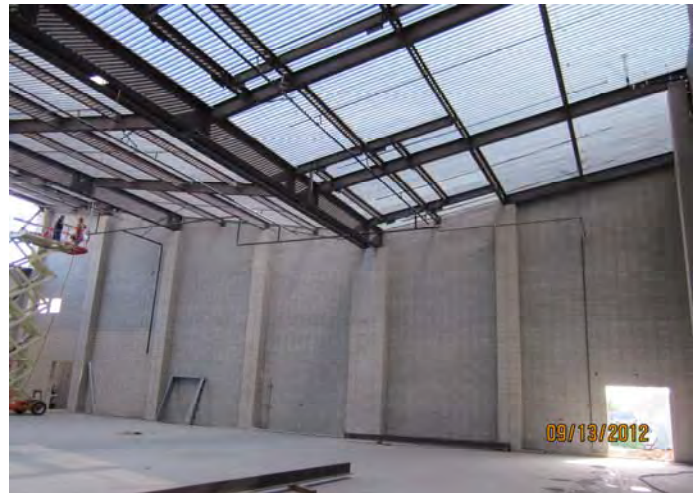
Metal Decking (Gym Roof)