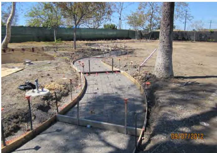
Concrete Forming (Walkway Near Pool)