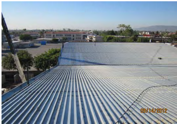
Metal Decking (Gym Roof)