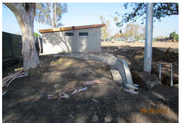
Poured Seatwall (Adjacent to Restroom Building)