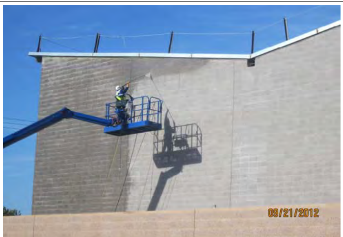
CMU Walls Pressure Washing