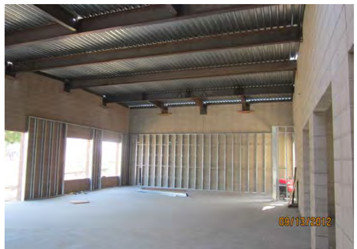
Framing (Recreation Area)