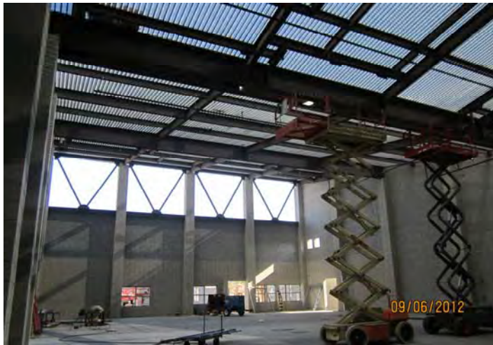
Metal Decking (Gym Roof)