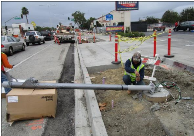
Installing pedestrian light poles on north side of Carson.