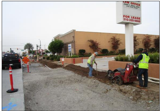
Trenching for street light conduit.