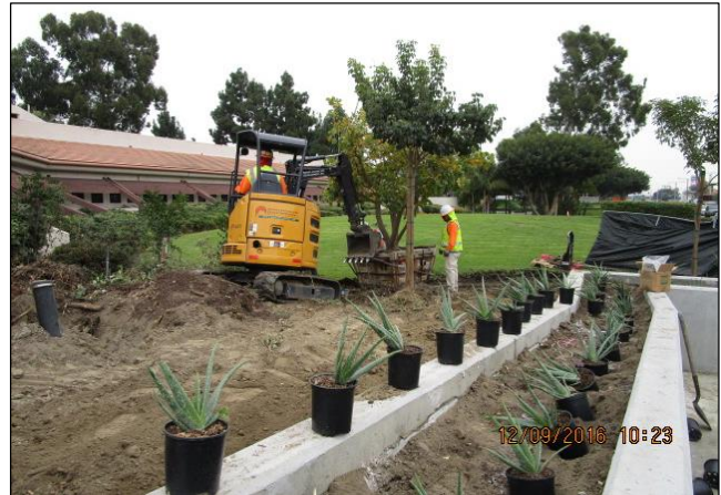
Planting trees and shrubs at City Hall.