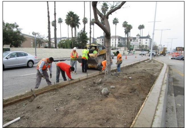
Placing exposed aggregate strip on median island.