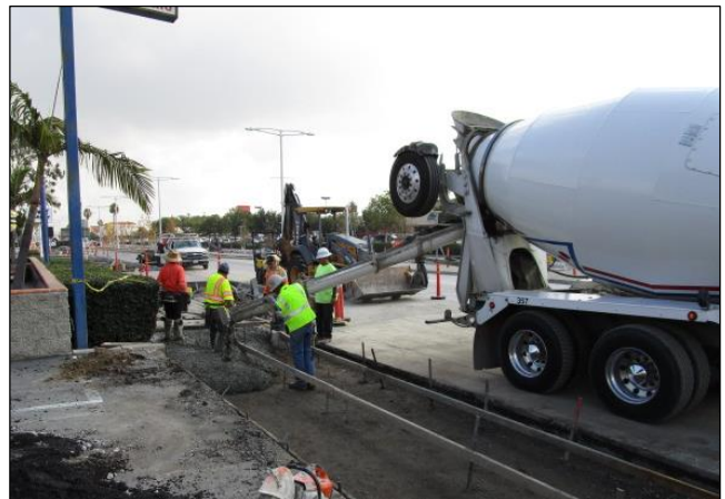
Placing driveway on north side east of Figueroa.