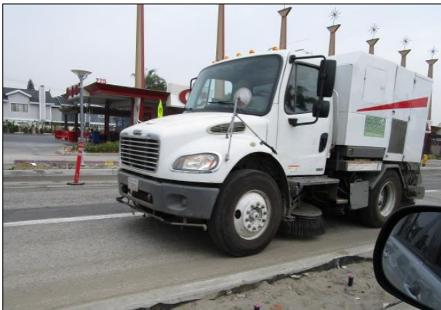
Sweeping project area.