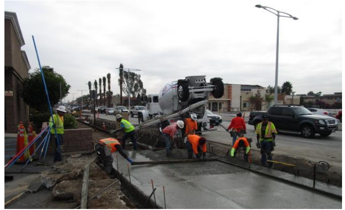
Placing driveway on Carson just east of Figueroa.