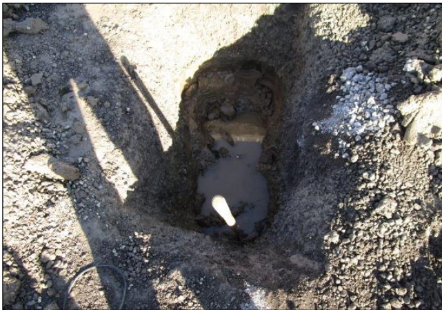
Potholing for Exxon gas lines.