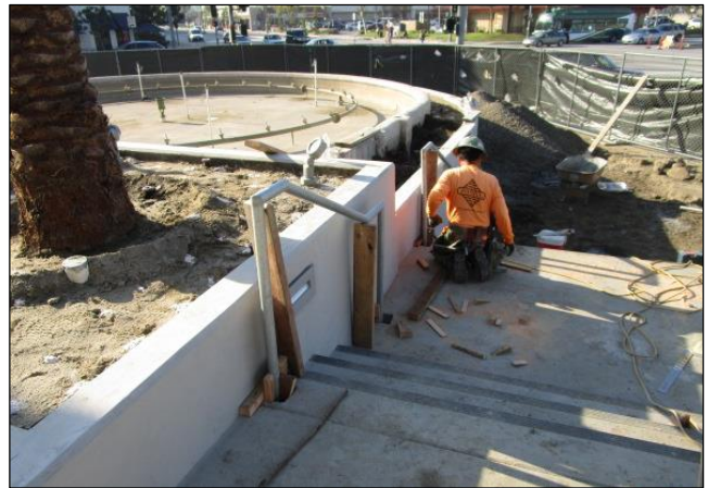
Installing handrail at City Hall.