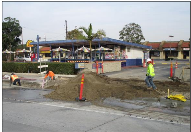
Grading Driveway east of Main.