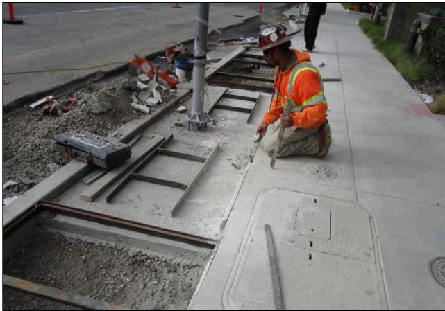
Installing tree grate frames north side west of Grace.