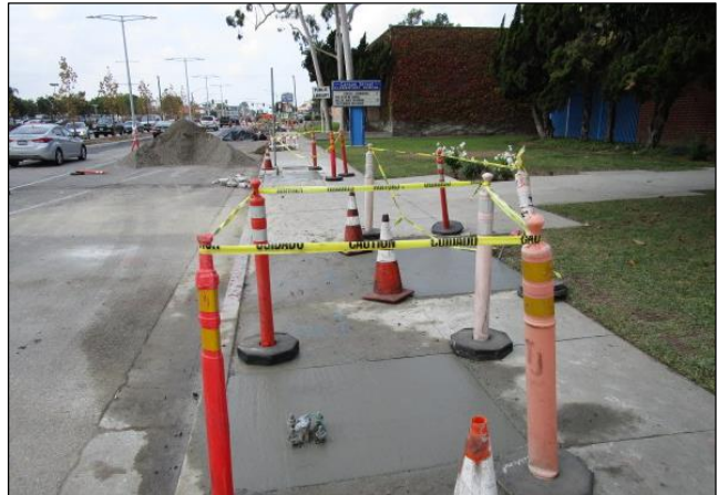
Sidewalk placed north side east of Main.