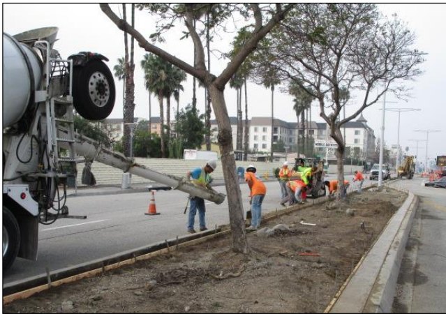
Placing exposed aggregate strip on median island.