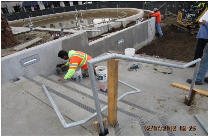
Installing handrail at City Hall.