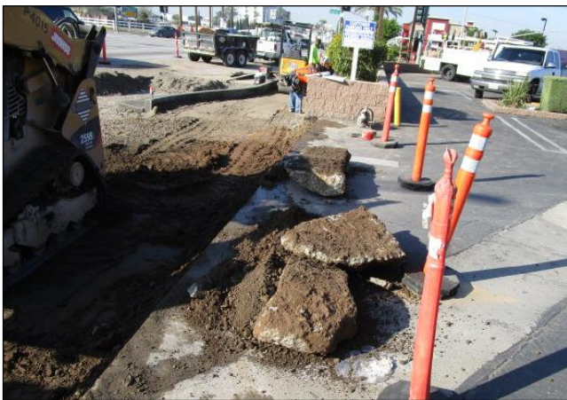
Slag removed from driveway east of Figueroa.