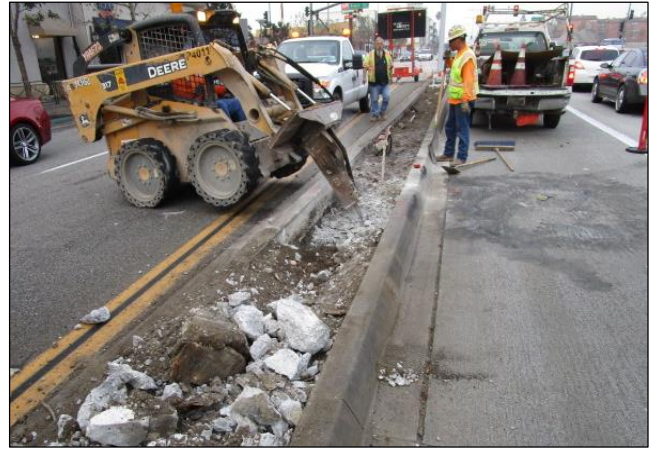
Removing old streetlight foundations east of Avalon.