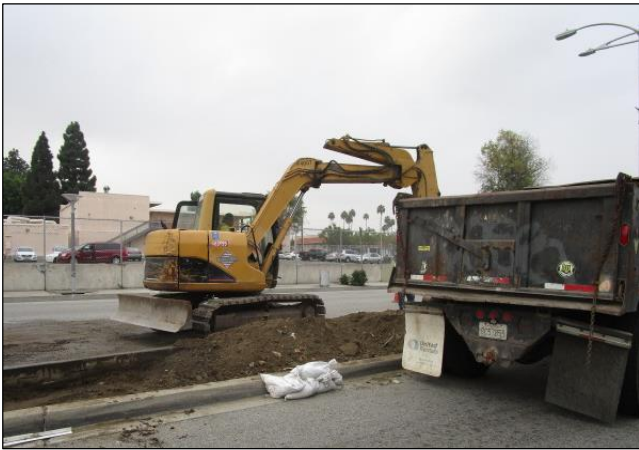
Removing old median soil east of Avalon.