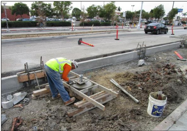
Placing foundation for pedestrian pole on north side of Carson.