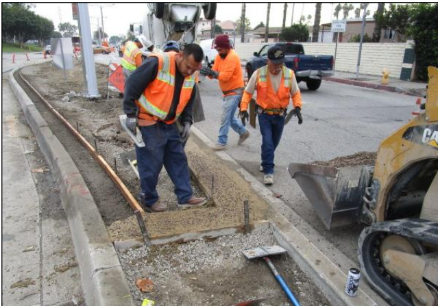
Placing exposed aggregate in median east Avalon.