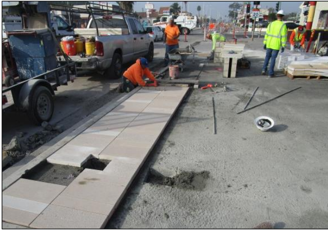
Installing architectural pavers north side east of Dolores.