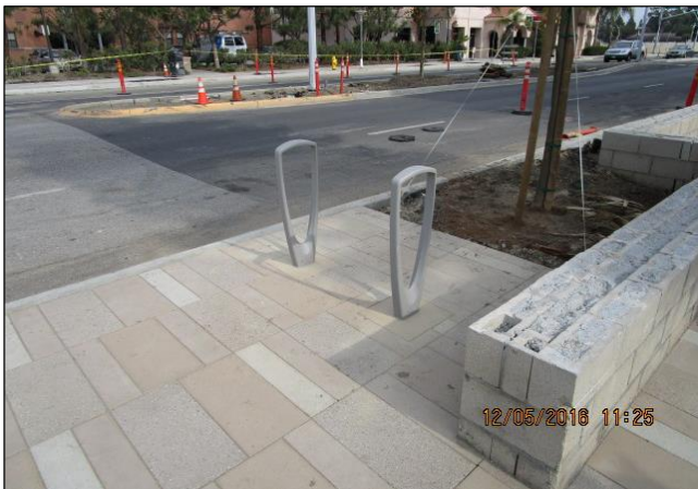
Bicycle racks installed east of Grace.