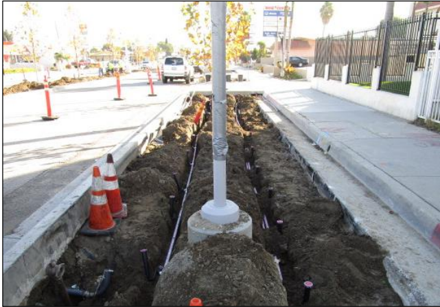
Irrigation system at Carson Street island between Main and Grace.