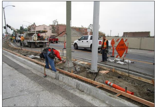
Forming for exposed aggregate in median east of Avalon.