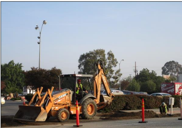
Trenching for street light conduit on north side of Carson.