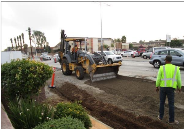
Grading driveway east of Figueroa.