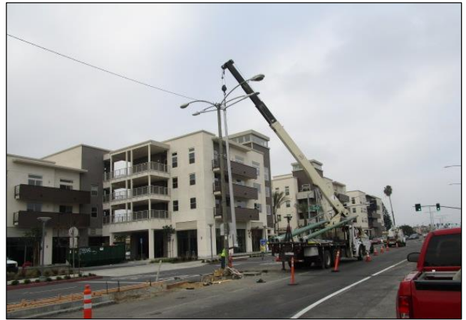
Installing new street light east of Grace.