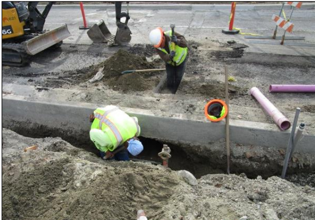
Connecting to water main on north side of Carson.