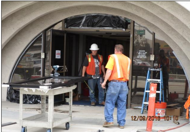
New door being installed at City Hall.