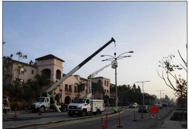
Removing old street lights from Carson median.