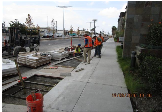
Placing pavers on north side between Dolores and Grace.