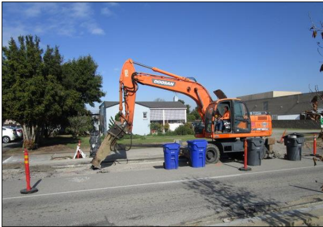
Excavator breaking up slag on north side between Main and Moneta.