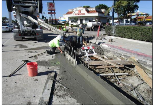
Powell places 6"x12" C&G north side Carson Street east of Main.