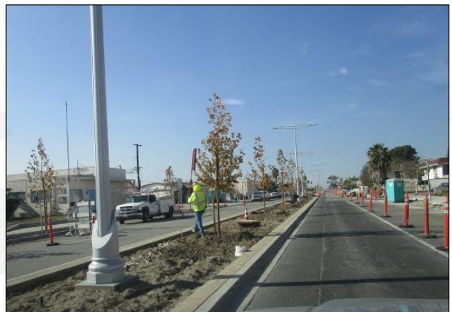
Staking new trees.