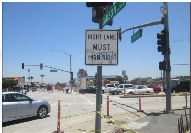
Out of Plum Eastbound Figueroa Southwest Corner