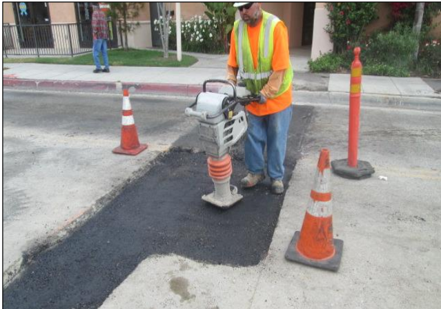
Compacting Asphalt Concrete at Recycled Water Line