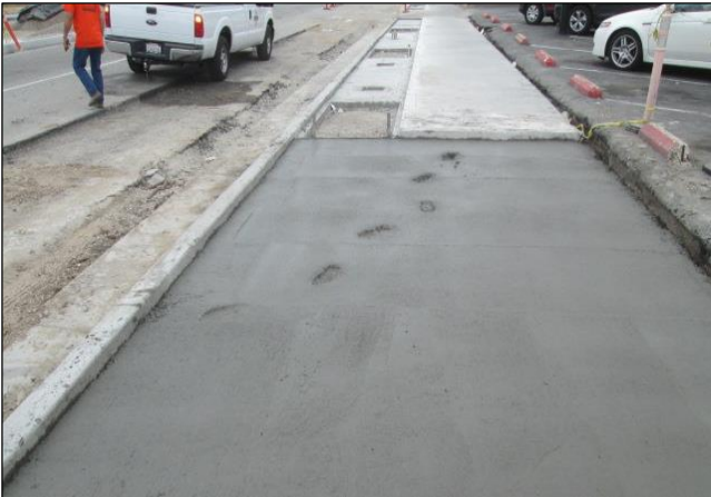
Recycled Water at Change in Elevation