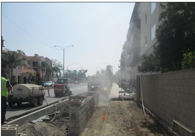
Dust Control Required Station 83+91