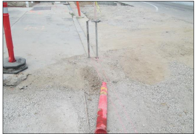
There Will Be No Culvert at Urgent Care Driveway