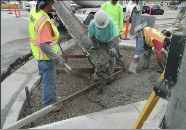
Placing Portland Cement Concrete Ramp Southeast Corner of Moneta