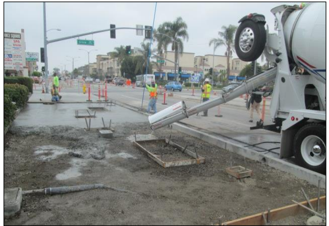
Portland Cement Concrete at Future Bus Shelter Grace and Carson