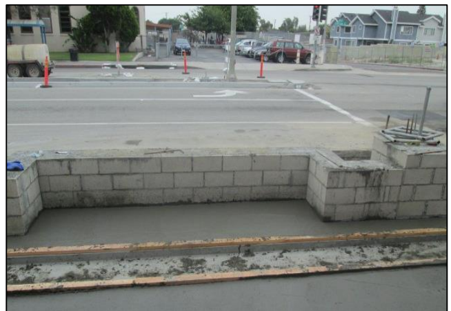
Seating Node at Winchell's