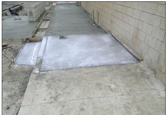
New Sidewalk at 84+00