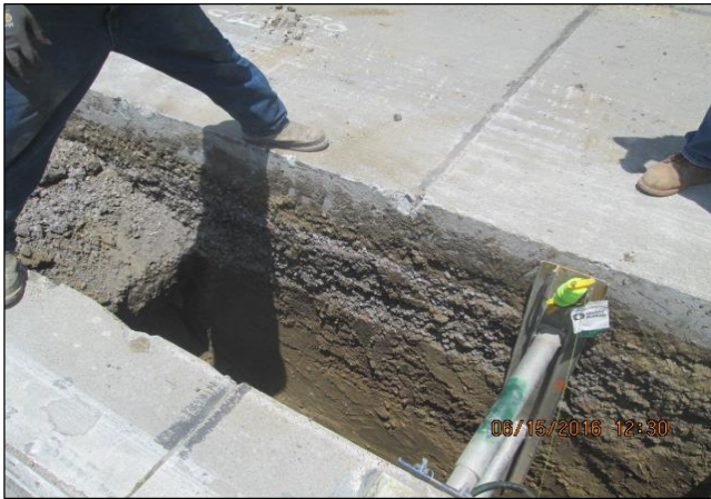
Slag Material at Station 51+56