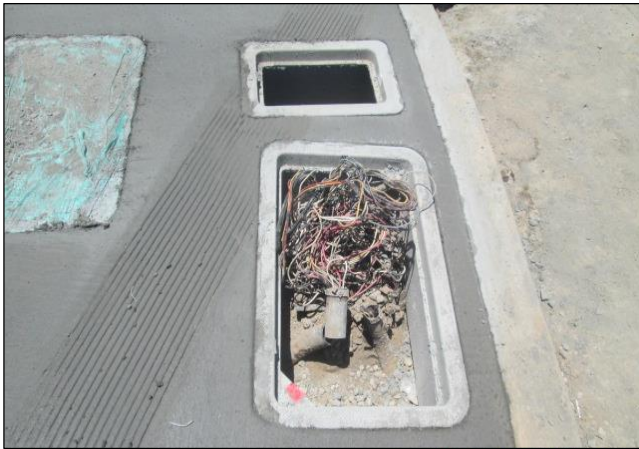
Pull Box in ADA Ramp Figueroa and Carson