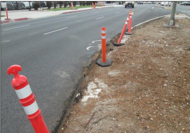
Southbound on Avalon Curb Removed Left Turn Lane to Desford