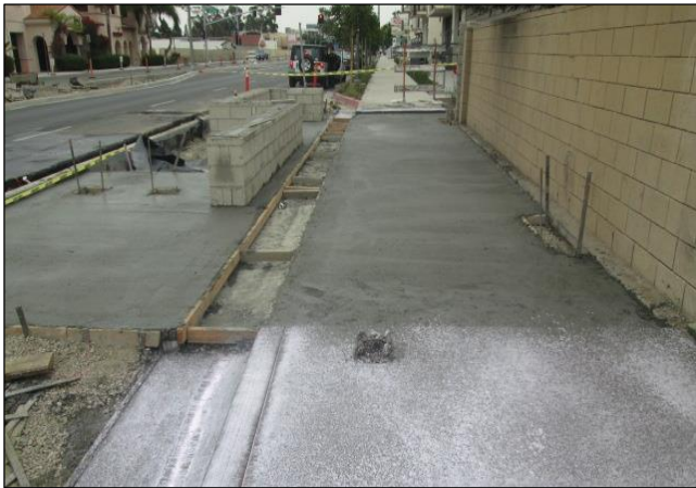
Portland Cement Concrete Underlayment at Station 84+00