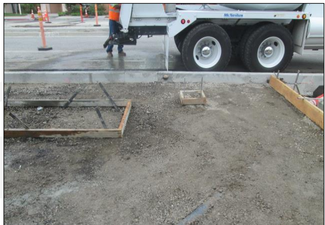
Bus Stop at Grace Drain to be Relocated to Curb