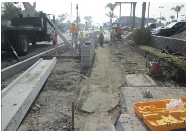
Portland Cement Concrete for Seating Node at CVS