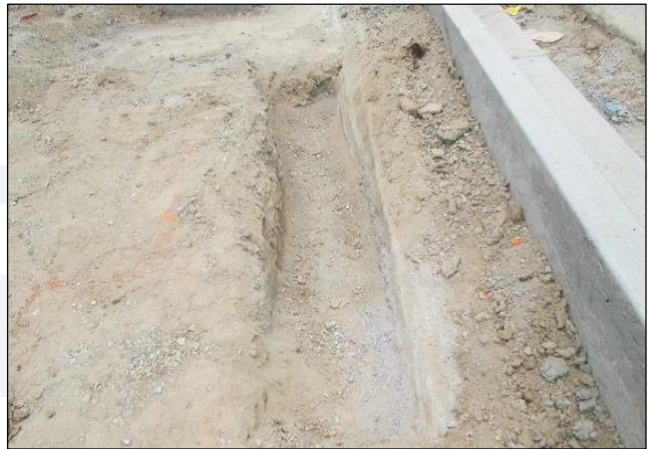
Pothole Foundation for Seating Node Wall