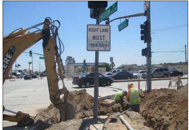
Southwest Corner Figueroa and Carson