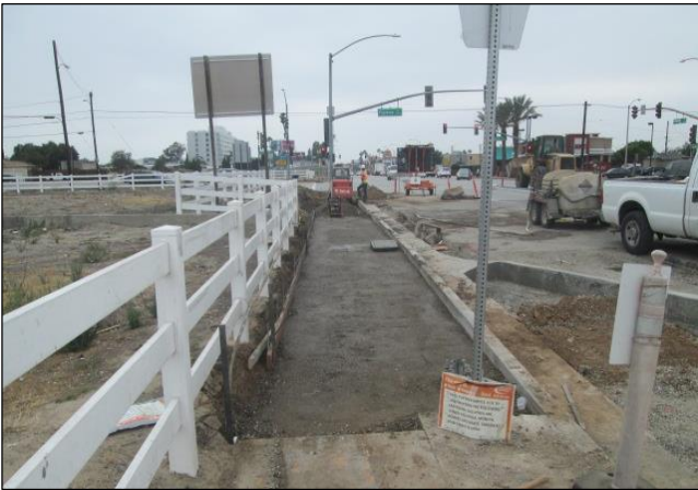
Eastbound South Side of Carson Figueroa in Background