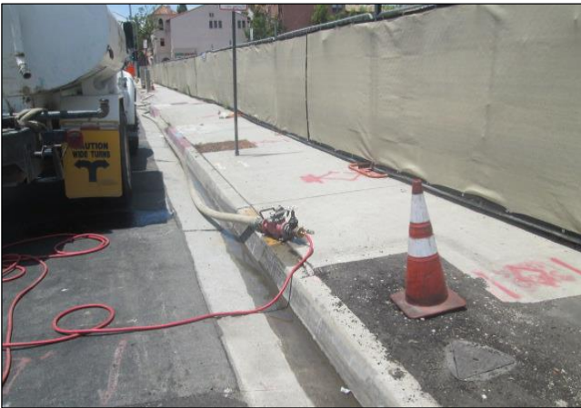
Water for Test Supplied Via Hydrant at 80 PSI