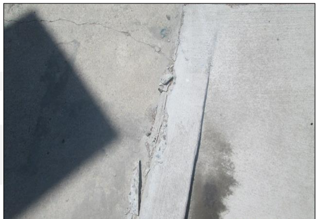
Broken ADA Curb at Grace and Carson