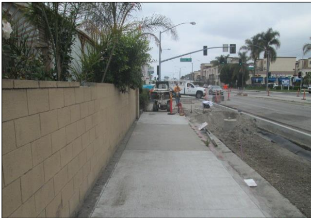
Looking West/ South Side of Carson at Station 84+00