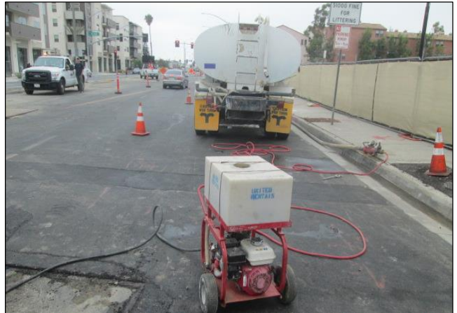
Measured Water for Pressure Test