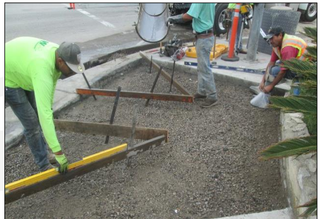
Constructing ADA Ramp Southeast Corner Moneta