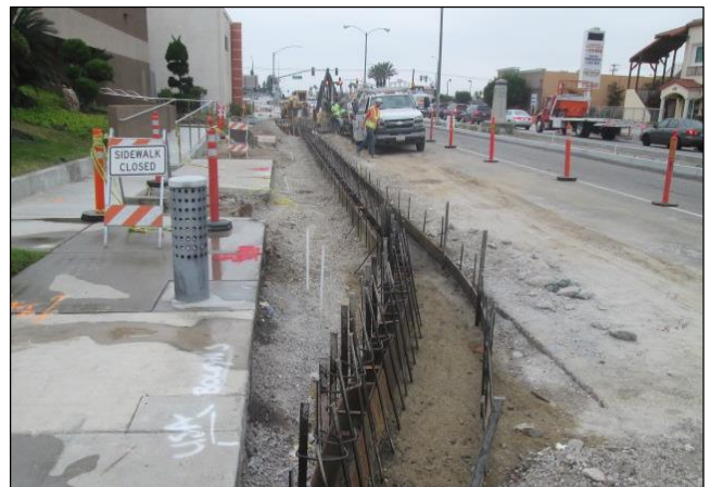
Ready for Portland Cement Concrete