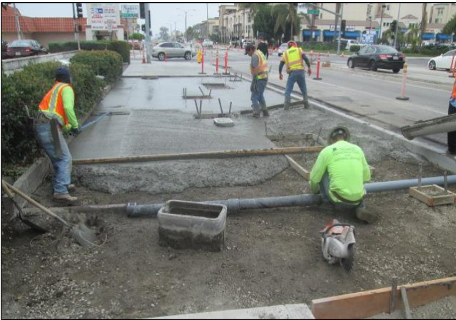
Drain Line Being Relocated to Curb