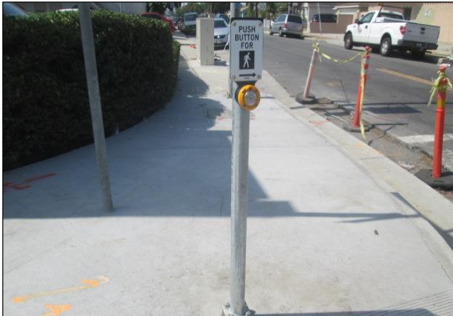
Pedestrian Push Button at Southeast Corner of Grace and Carson