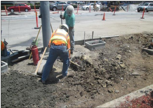
Placing Traffic Control Pull Box Main and Carson