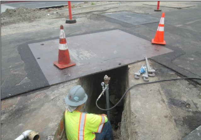
Recycled water Pressure Test Underway