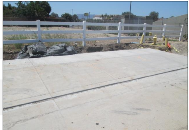
Driveway South Side of Carson West of Figueroa