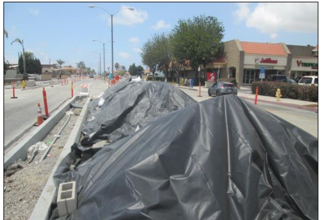
Contaminated Spoil Removed from Recycled Water Trench and Stored