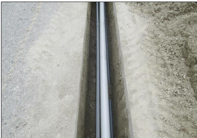
Irrigation Piping and Electrical Conduit Sharing Trench