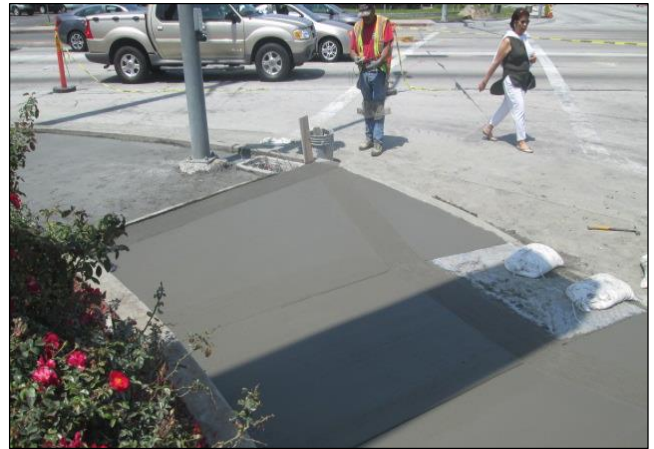
Completed Ramp Southeast Corner Main and Carson