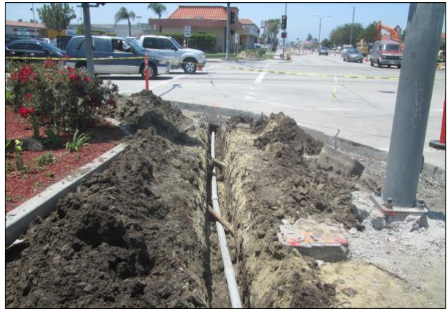
Conduit at Main and Carson