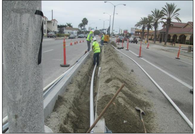
Irrigation Line from Main to Moneta