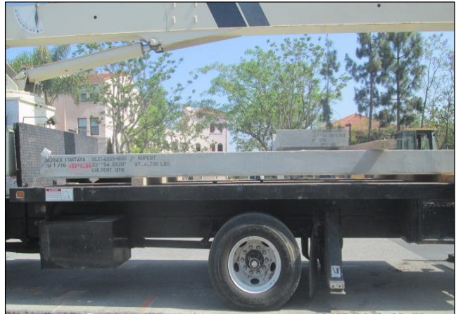
Seating Node Culvert at Station 83+91