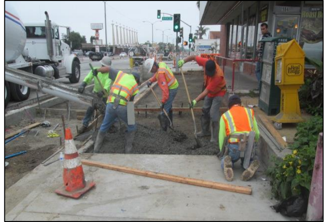
Beginning of Concrete Pour