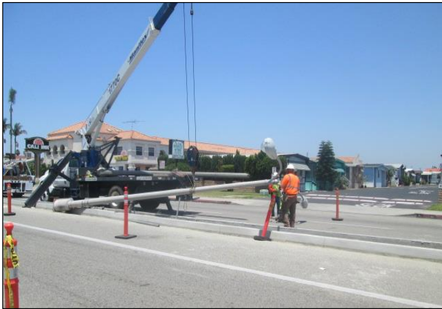
Removal of Existing Light Poles