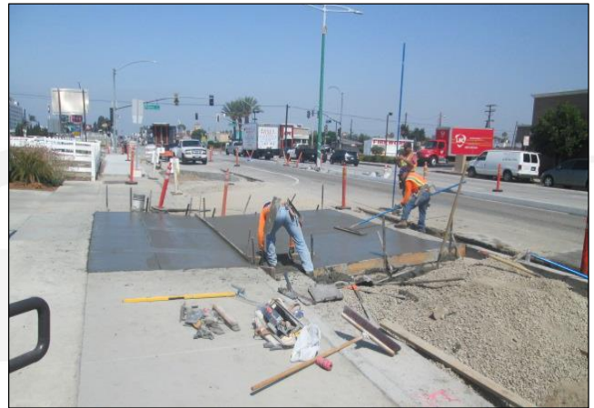
Floating PCC Driveway South Side of Carson Street Adjacent to Urgent Care