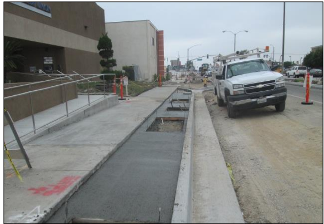
Portland Cement Concrete Underlayment at Federal Credit Union