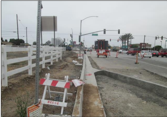
Looking West from Urgent Care