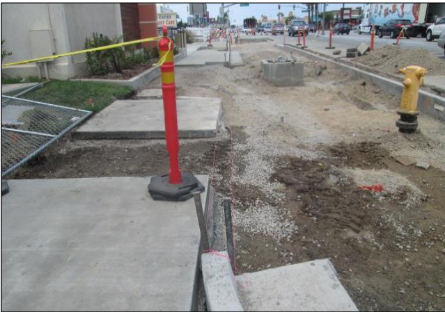
Seating Node at Urgent Care