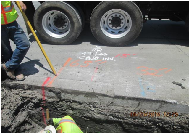
Recycled Water Trench at Intersection of Main and Carson