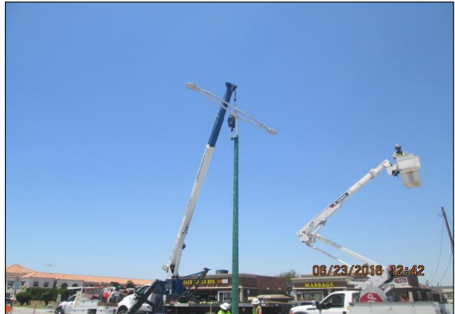
New Street Lights Being Erected