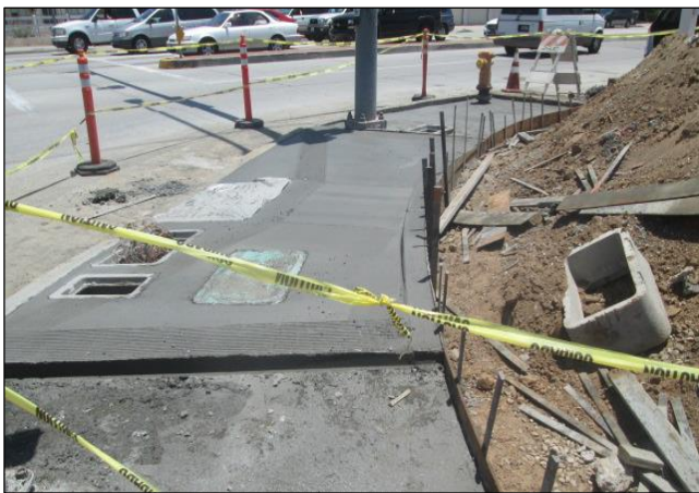
ADA Ramp Southwest Corner of Carson and Figueroa