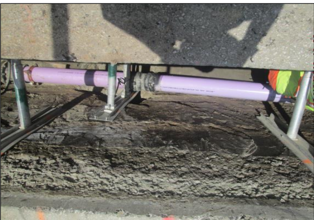
Recycled Water at Change in Elevation