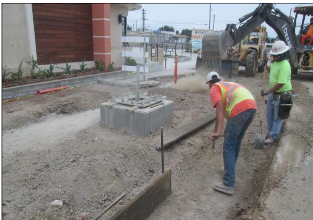
Preparing Grade for Curb and Gutter Installation