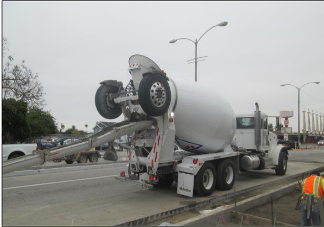
Portland Cement Concrete for Seating Node