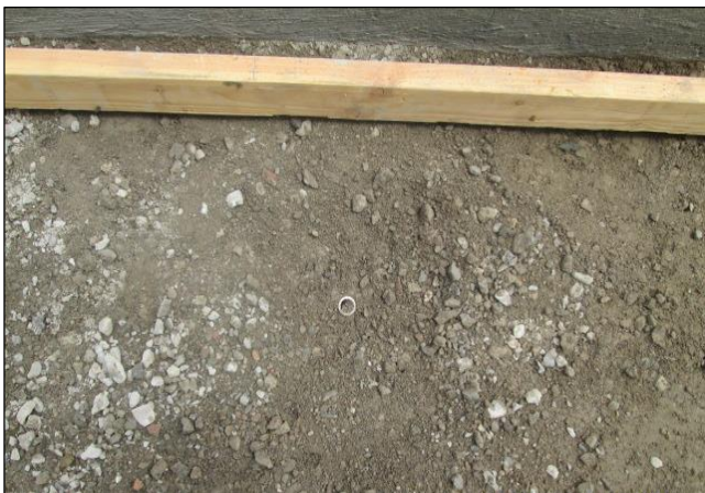
Tree Well Approx. 400 Carson Buried Irrigation Line