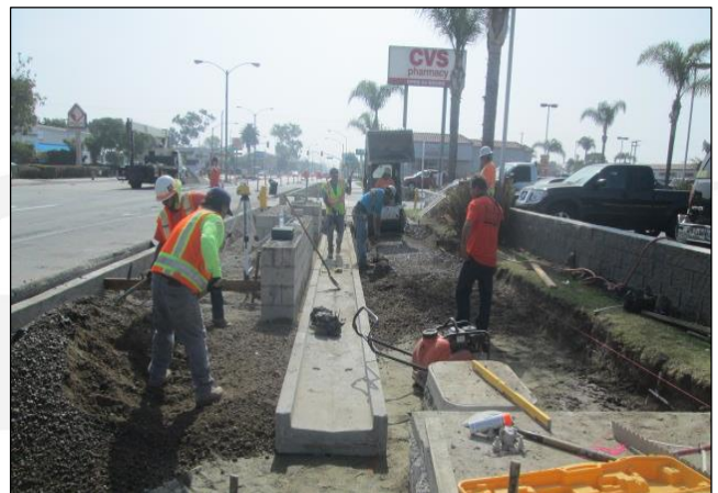
Pre-fab Culvert at Seating Node at CVS