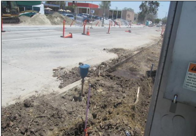
Air Vac Repair Main and Carson