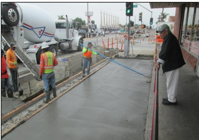
Seating Node Being Poured