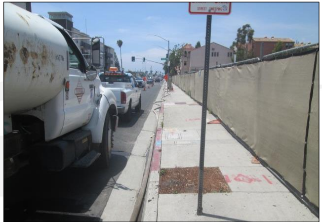
Line of the Hose from Hydrant to Test Area