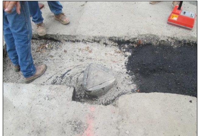
Compliance with R7 Westbound Recycled Water Specifications