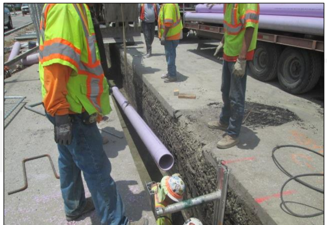
Inserting New Length of Recycled Water Pipe