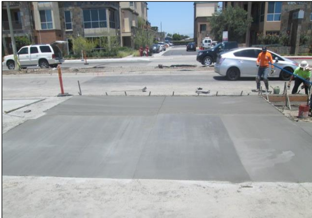
New Driveway at Florist Shop