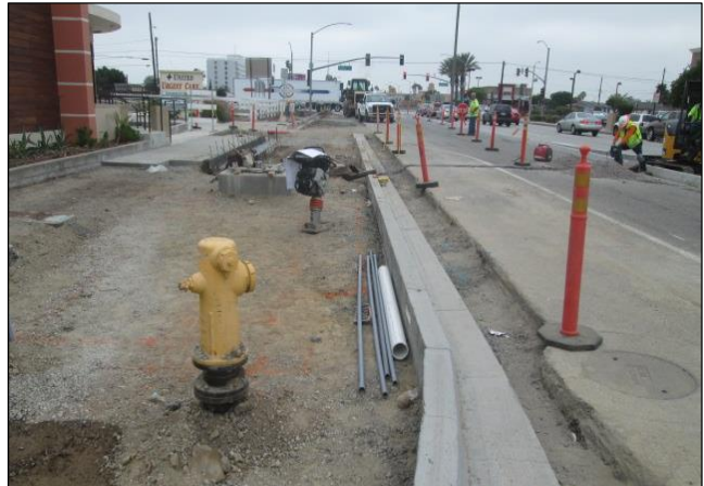
Seating Node Layout at Federal Credit Union