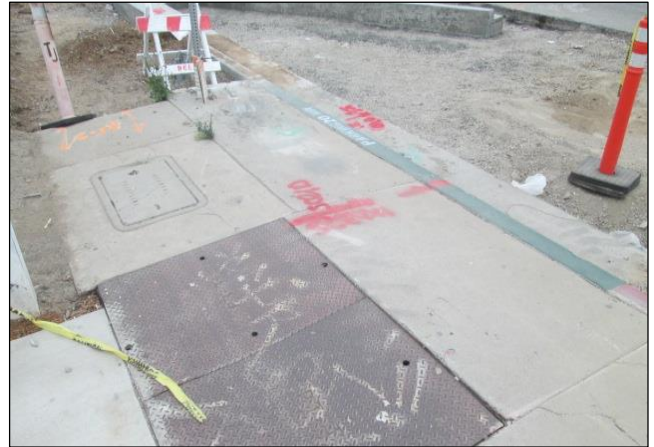
Existing Southwest at Bus Stop at Urgent Care